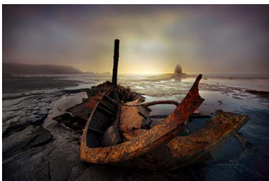
Above. Admiral Von Tromp