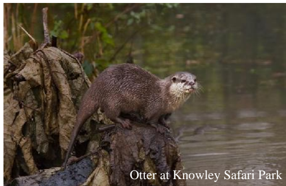
Otter at Knowley Safari Park

Meet the PAGB Executive Committee members