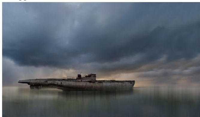
German Submarine, Birkenhead or "Jerry cross the Mersey"

During my time in photography I have met some truly inspiring people. I have become a judge and lecturer on the circuit, and sometimes, like us all, I have to remind myself this is only a hobby and is supposed to be fun... most of the time it is.