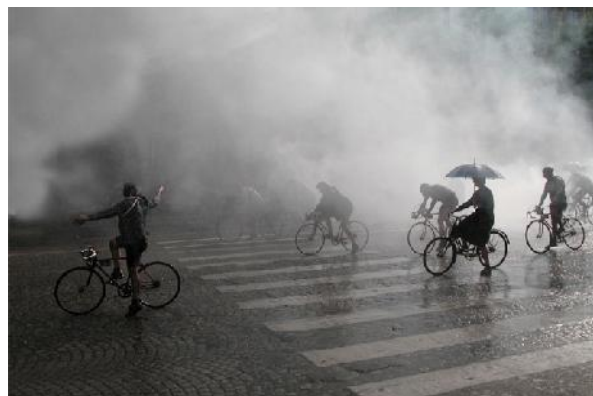
Bicycles in a Parade on the Champs Elyees, Paris