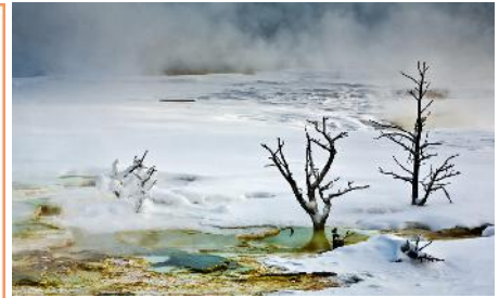
Cupid Spring – Mammoth Hot Springs Below - Tabular Berg, Scotia Sea and Gentoo's At Play

Meet the PAGB Executive Committee members