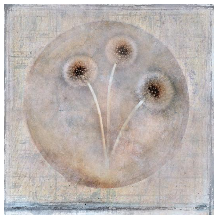
Set of Three by Steven Le Prevost (Guernsey) (GB Cup Judge 2012)