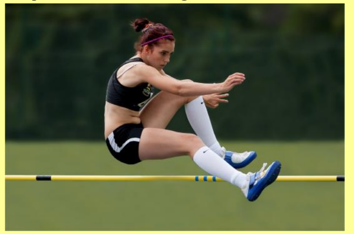
See more of Paul's photos at www.boswellimages.com

and international competitions with a view to one day attaining my BPE and CPAGB awards. Over the last five months I' have managed 19 acceptances in all competitions so I'm looking forward to 2012!"