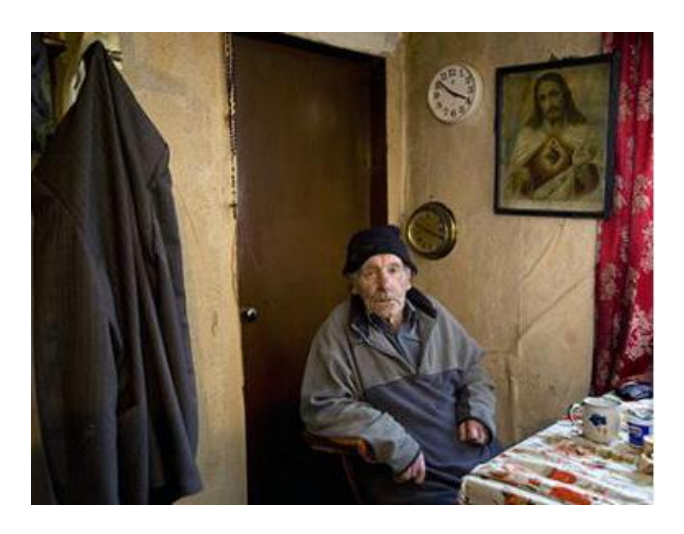
Jimmy – Co. Monaghan by Des Clinton FRPS FIPF MFIAP, GB Cup Judge 2012

http://www.pagb-photography-uk.co.uk/misc-pdfs/issue_16.1_gb_cup_general_and_digital_rules_10_11.pdf