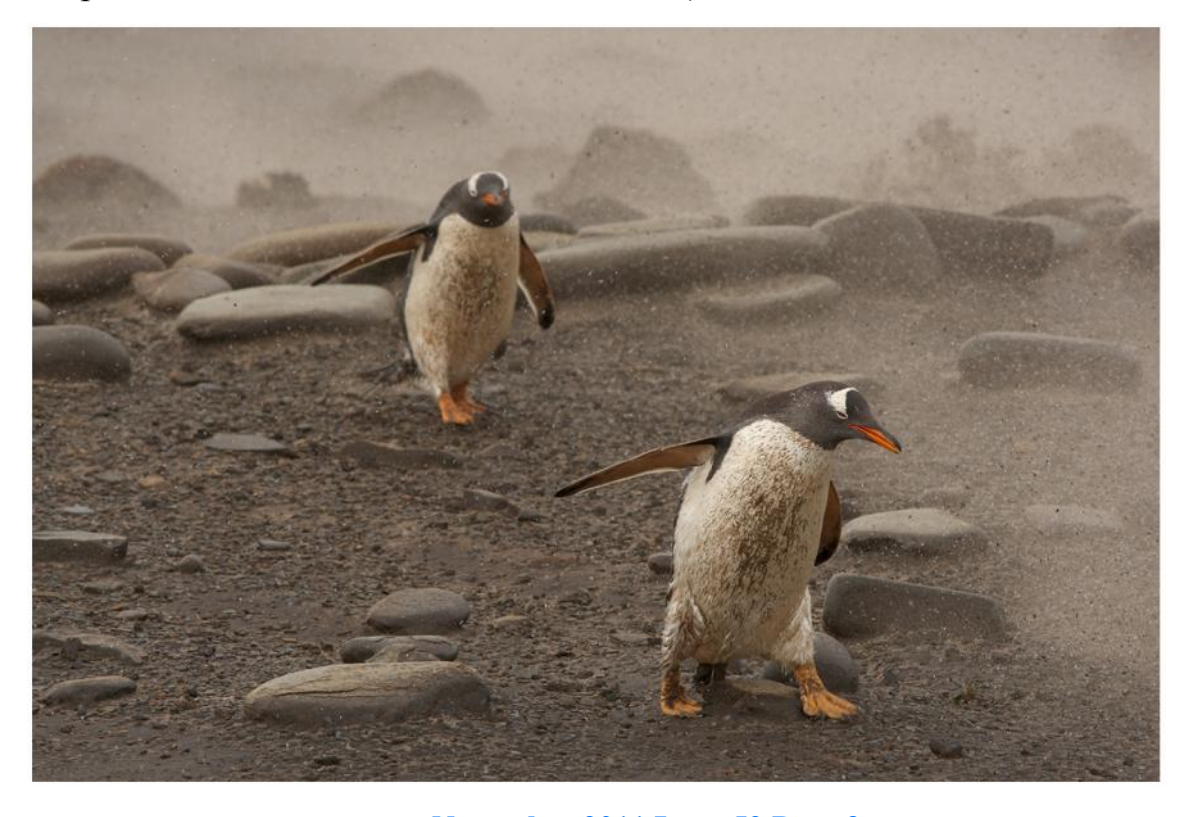
e-news November 2011 Issue 52 Page 3

It is fair to say that there was some controversy about the judging with some prints dropping in score by up to 3 points from the First Round in the Plate and in the Final but our very experienced judges can only call it as they see it and no-one can have any complaint about the final result. (More illustrations in a later e-news ).