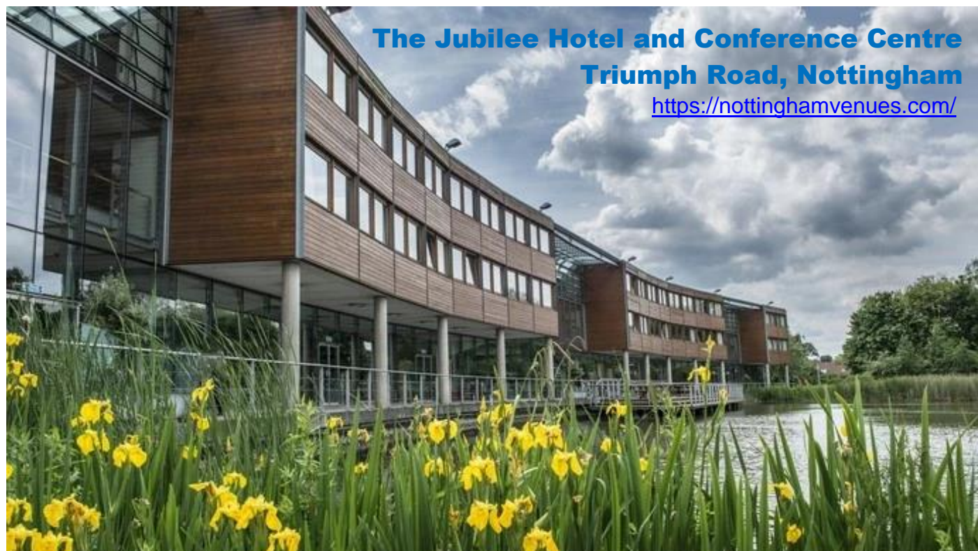
The Jubilee Hotel and Conference Centre Triumph Road, Nottingham

The hosts, N&EMPF, have secured an excellent venue for the November Adjudication. Unfortunately the facility has proved unsuitable for the satisfactory projection of PDI which will be assessed on Sunday 26 November in the Smethwick PS Clubrooms in Oldbury. This Adjudication is now closed for entry with Prints but there are still spaces for PDI.