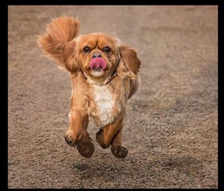
'Drivers Ready' by Bill Hall of Rolls Royce Derby Photographic Society (NEMPF) The GB Cup - Open 2021

Previous Winners. Rolls Royce (Derby) PS.