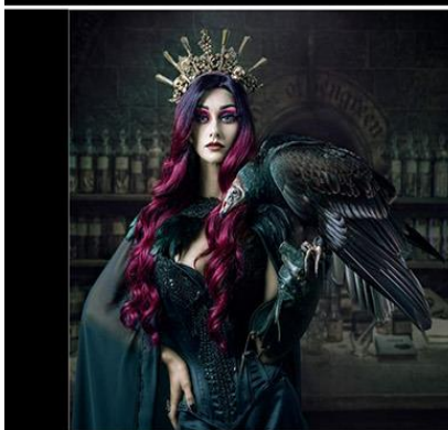
'Mistress Of The Dark Arts' by Sue Harley of Rolls Royce Derby Photographic Society (NEMPF) The GB Cup - Open 2021