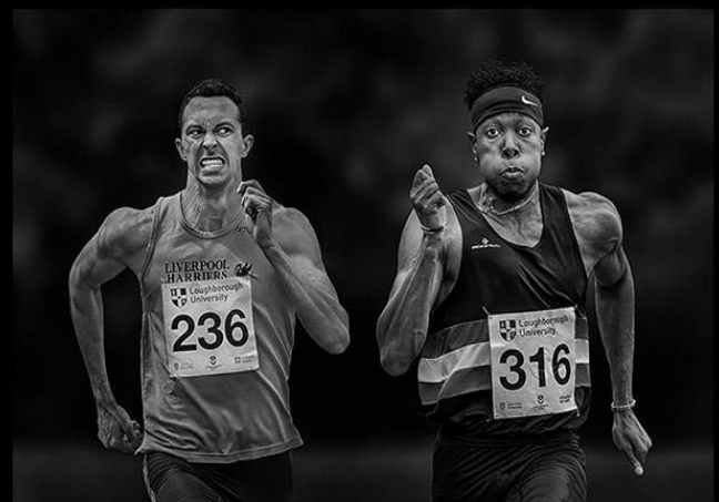
'Fighting To The Finish' by Brian Stephenson of Rolls Royce Derby Photographic Society (NEMPF) The GB Cup - Open 2021