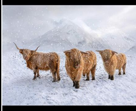
'Winter in The Highlands' by Jon Mee of Rolls Royce Derby Photographic Society (NEMPF) The GB Cup - Open 2021