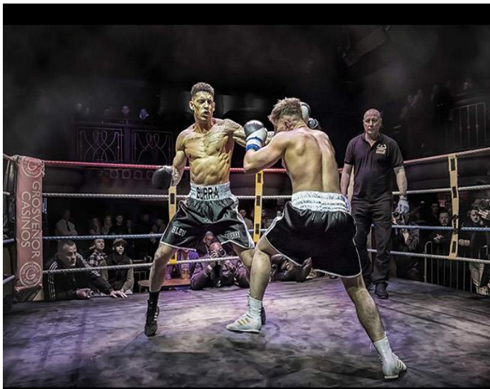
'The Bear Pit' by David Cudworth of Rolls Royce Derby Photographic Society (NEMPF) The GB Cup - Open 2021

See also guidance at http://www.thepagb.org.uk/wp-content/uploads/guidance_image_repetition.pdf