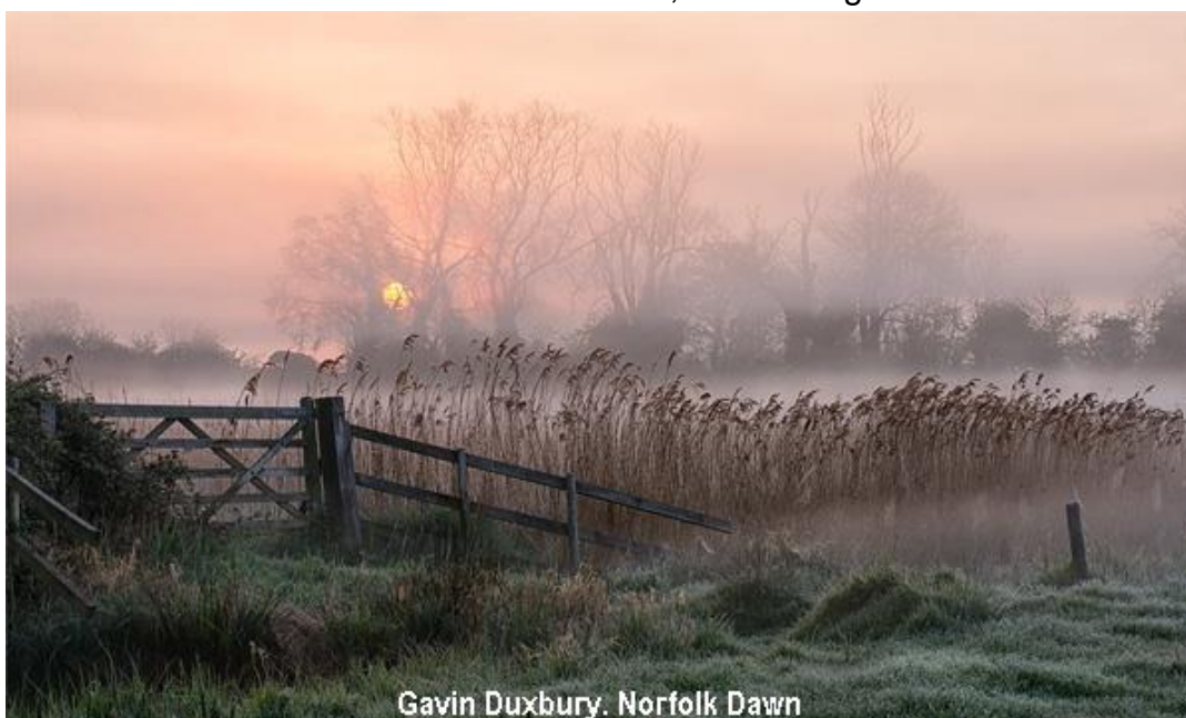
Gavin Duxbury. Norfolk Dawn

One of the successful CPAGB entrants in PDI. More on the two following pages.