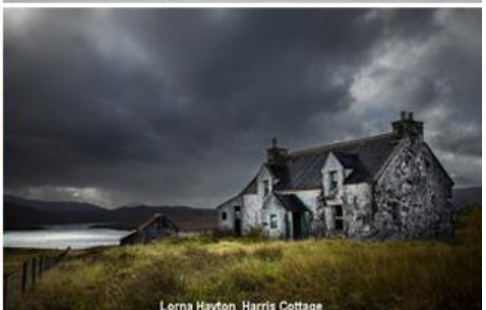
Lorna Hayton_Harris Cottage