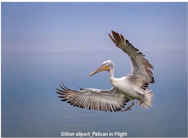
Gillian allport_Pelican in Flight