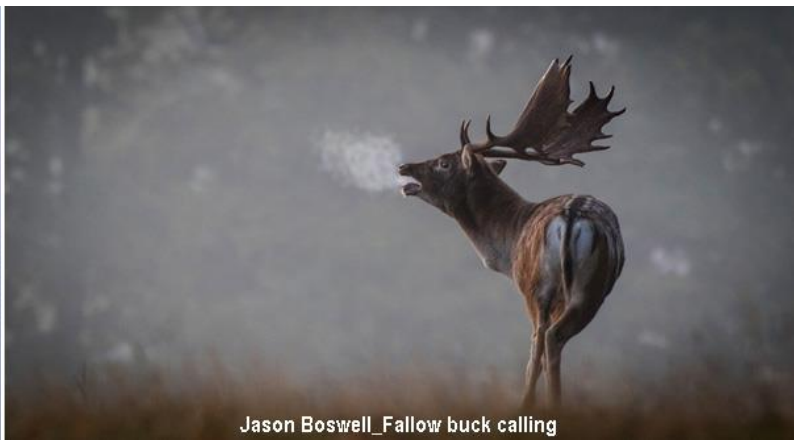
Jason Boswell_Fallow buck calling