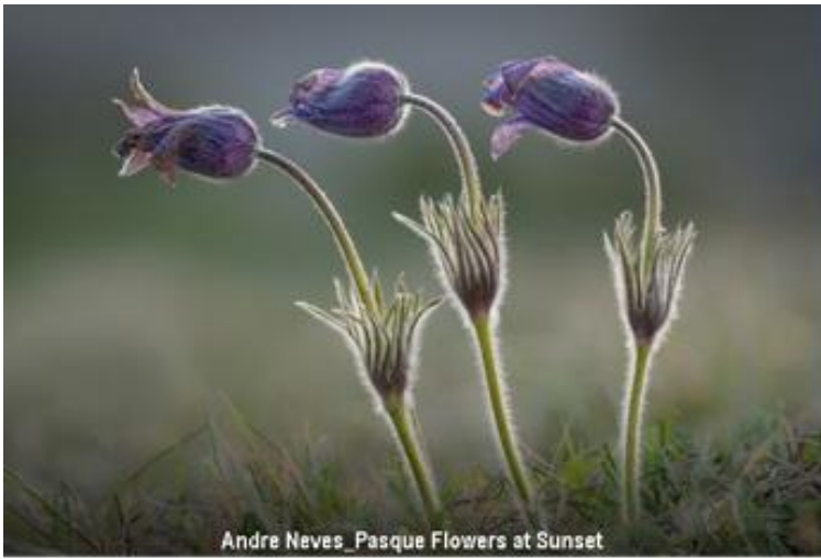
Andre Neves_Pasque Flowers at Sunset