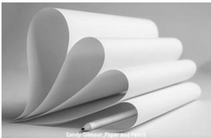
Sandy Gilmour_Paper and Pen 11