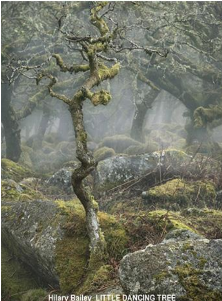
Hilary Bailey_LITTLE DANCING TREE