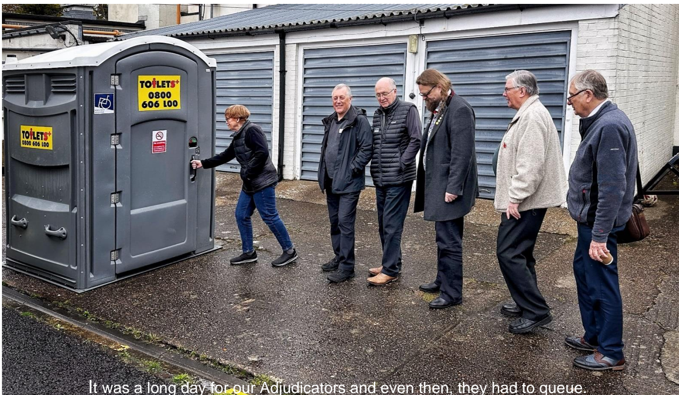
It was a long day for our Adjudicators and even then, they had to queue.