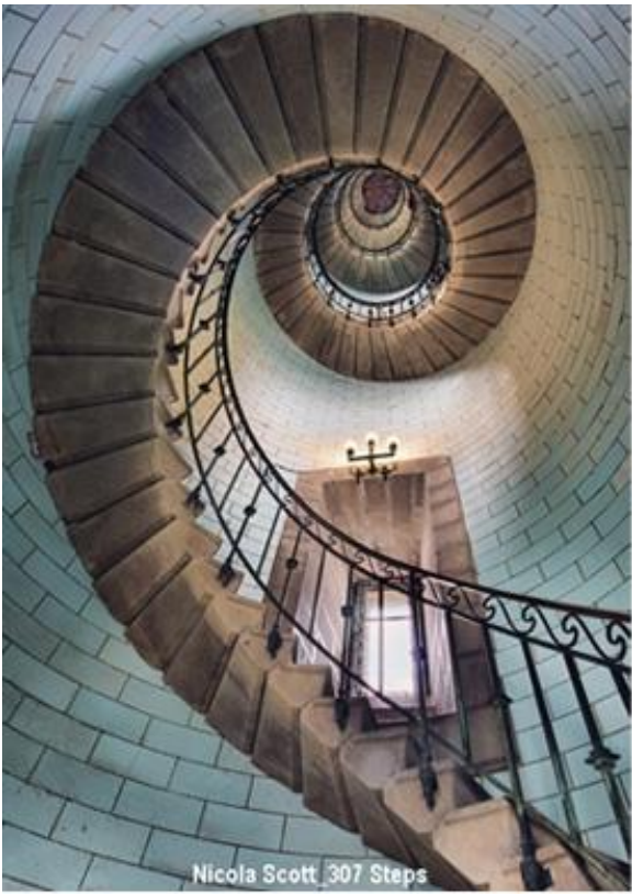
Nicola Scott_307 Steps