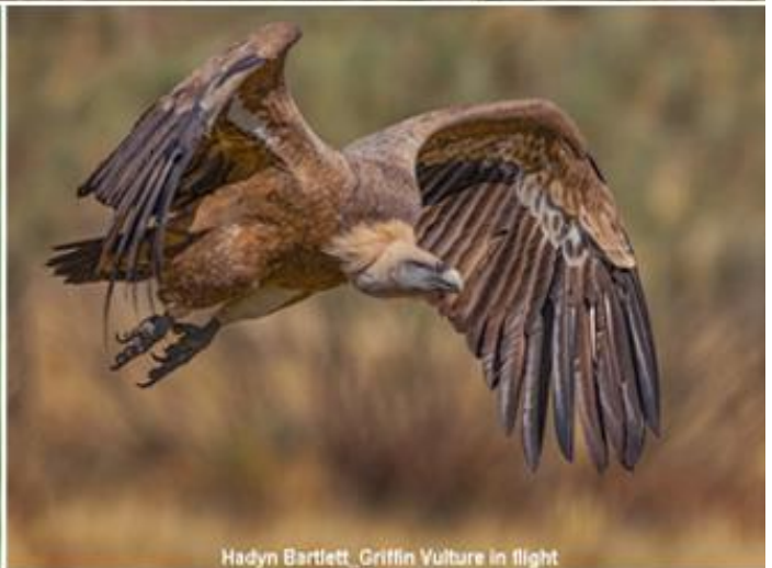
Hadyn Bartlett_Griffin Vulture in flight