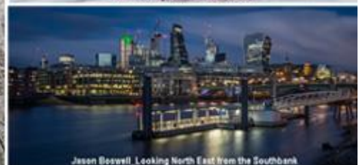
Jason Boswell_Looking North East from the Southbank