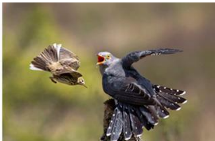
Ruth Hayton_Cuckoo mobbed by Meadow Pipit