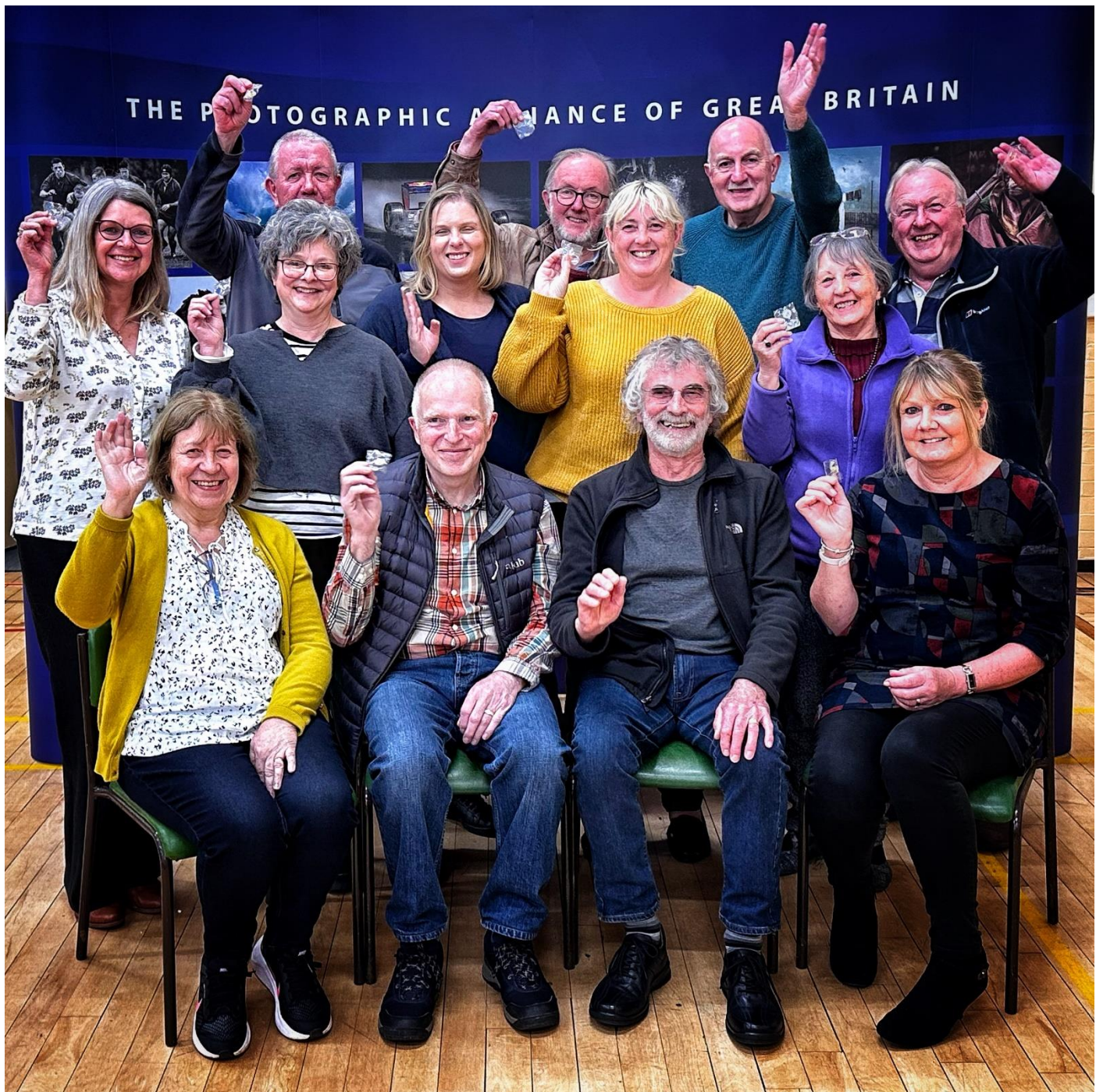
Some of the CPAGB entrants, celebrating their well-deserved success!