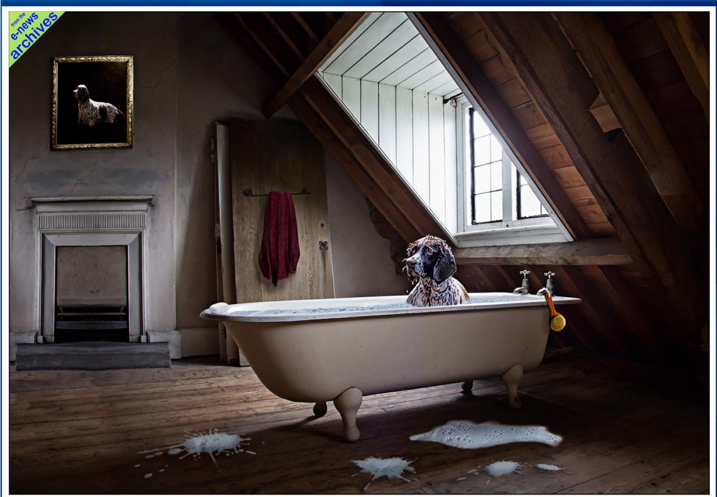
Dog Bath by Janine Ball DPAGB