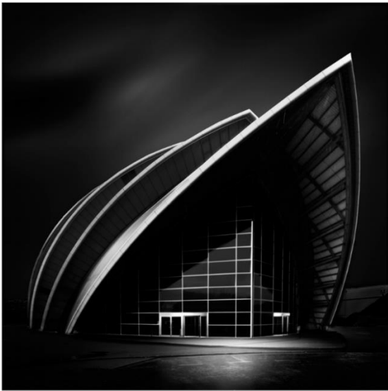
Glasgow Armadillo by David Moyes AFAP

The 2021 MASTERS OF PRINT is open for entry and, if you need inspiration, you can view the 2020 catalogue at - http://www.thepagb.org.uk/catalogues/mastersofprint_catalogue_2020.pdf