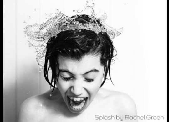
Splash by Rachel Green

www.hampsteadphotosoc.org.uk/virtual-exhibition