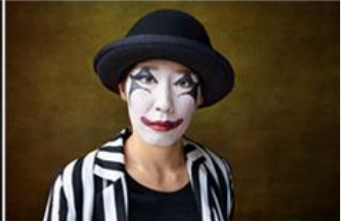
Page 8 of 12, e-news 280 extra. 15 April 2021