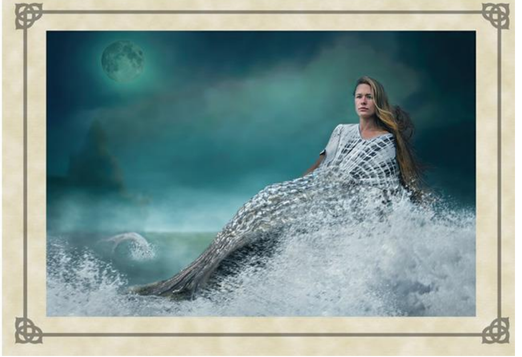
Page 6 of 12, e-news 280 extra. 15 April 2021