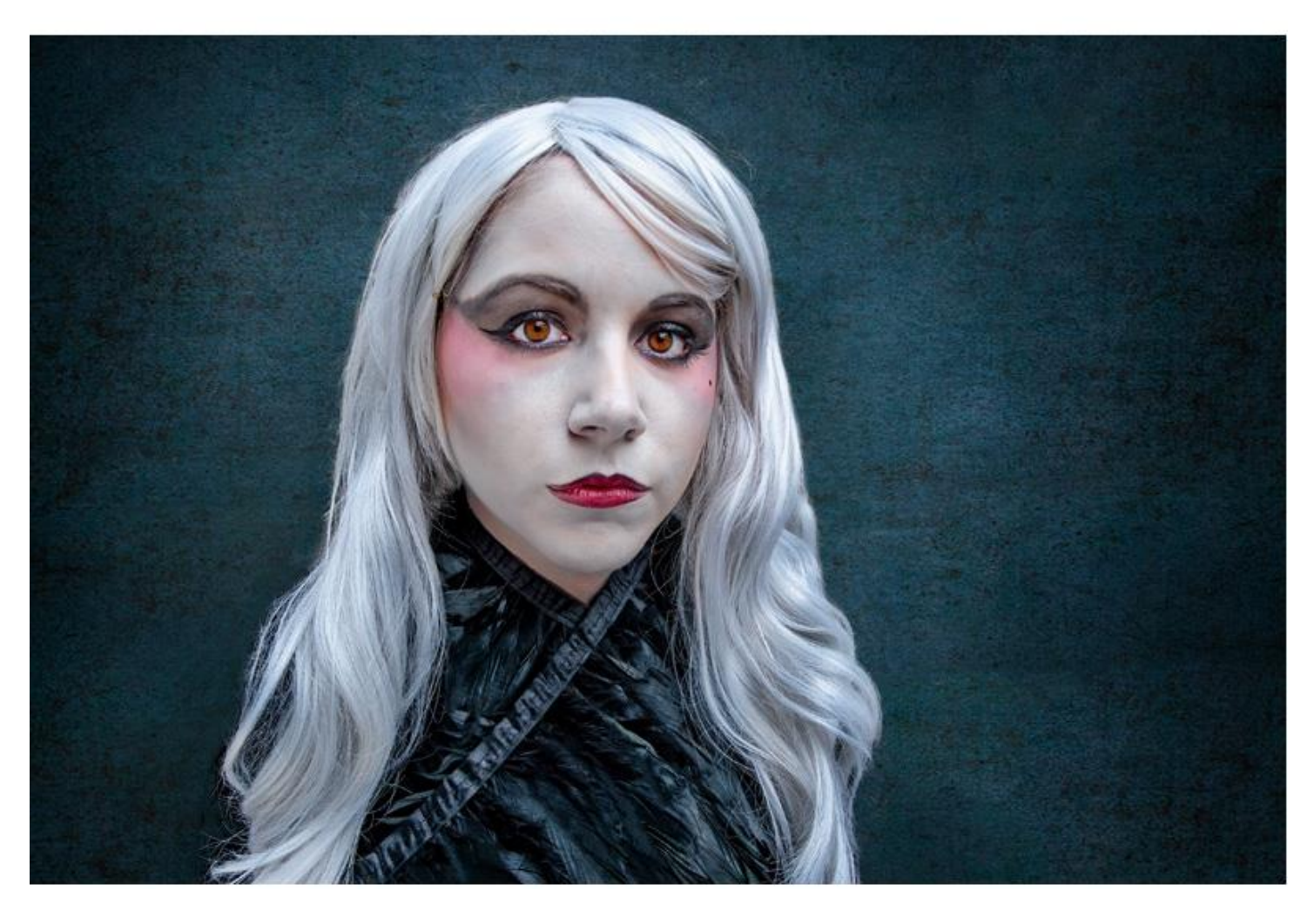
Page 11 of 12, e-news 280 extra. 15 April 2021