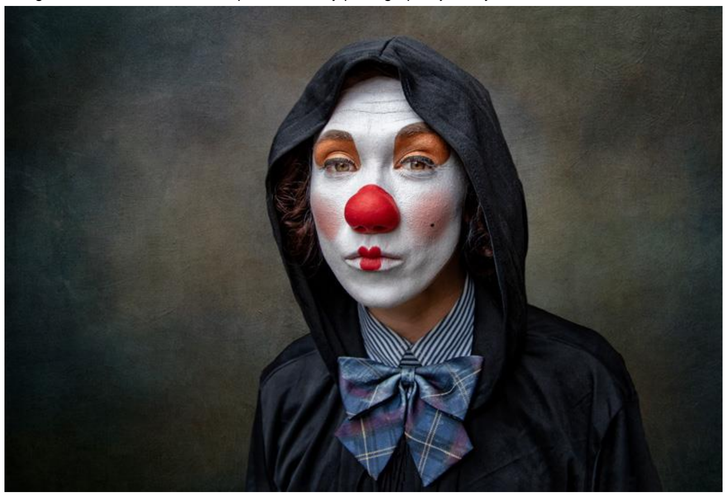
Page 7 of 12, e-news 280 extra. 15 April 2021

I participate in many UK BPE and International Photographic competitions and exhibitions and have recent gained my FBPE. I have also been lucky enough to have been gained 7 FIAP Blue Badges but being awarded this MFIAP is the pinnacle of my photographic journey.