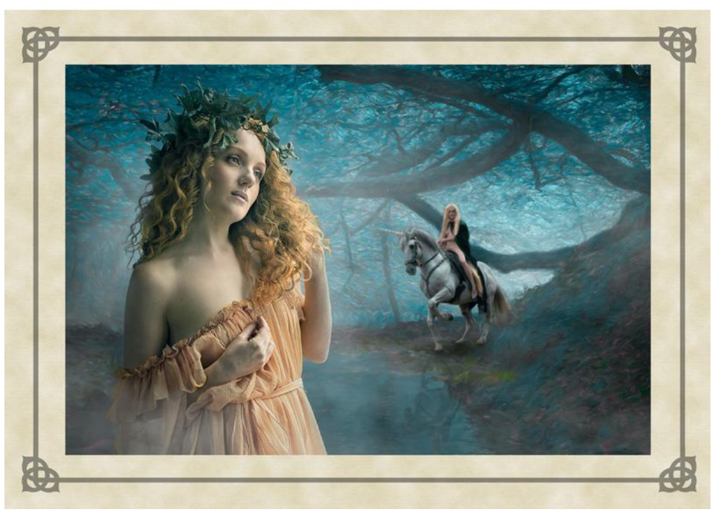
Page 3 of 12, e-news 280 extra. 15 April 2021