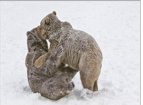
Page 11 of 12, e-news 263. 01 August 2020