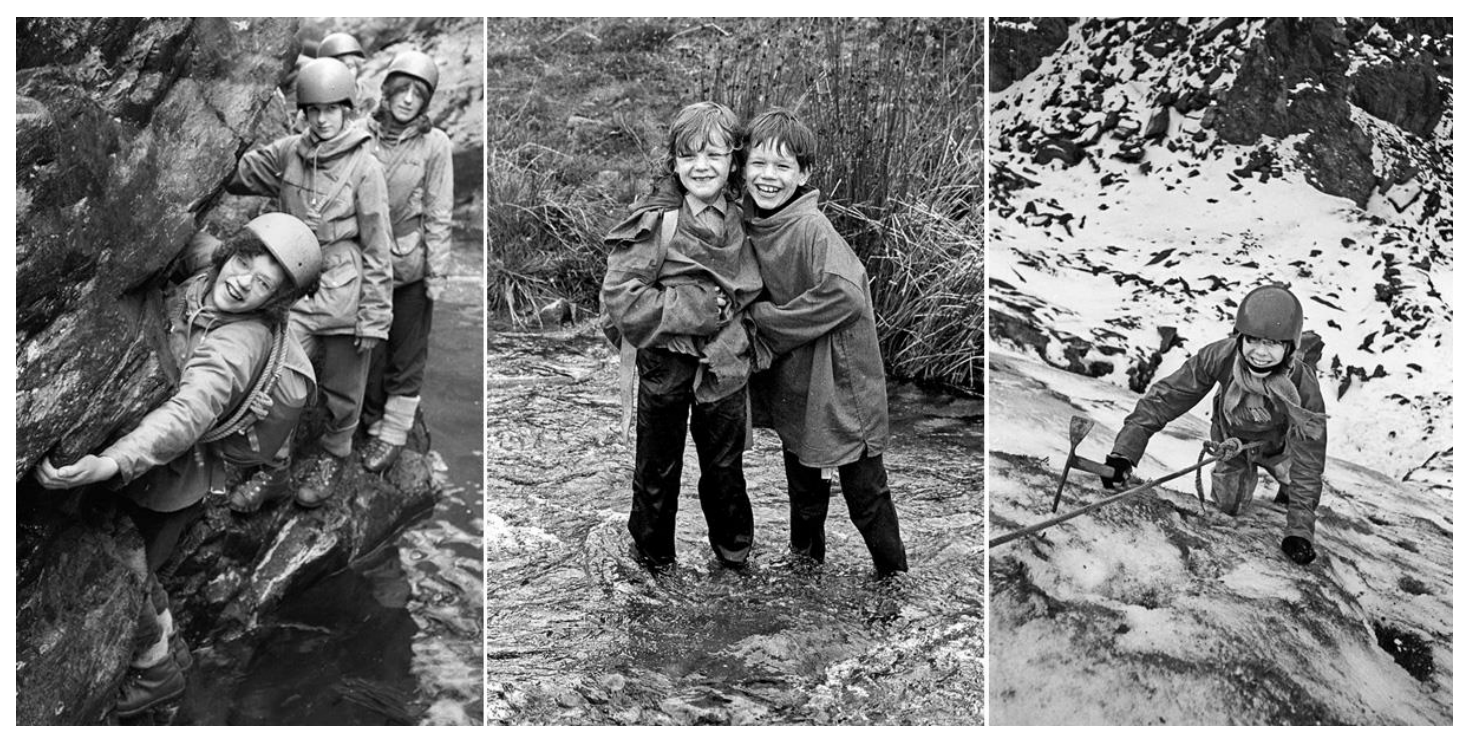
Page 8 of 12, e-news 263. 01 August 2020

My passion for photography allowed me to record many of the activities experienced by the kids from both cities. Most of the photographs were on B&W film, sometimes in demanding conditions. Little did I realise that I was documenting the experiences of so many kids completely outside their normal environment, as well as recording an important period in my life. Of course, at the end of each day, I had to return with the same number of kids I set out with!