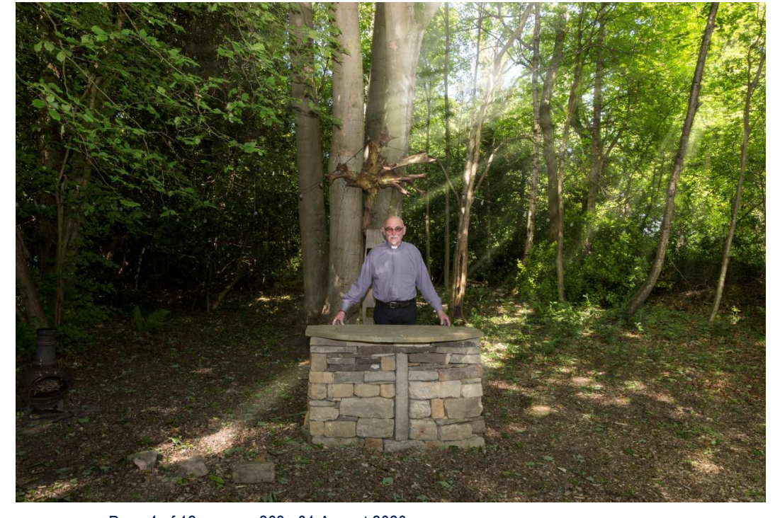
Page 4 of 12, e-news 263. 01 August 2020

He also posted this, and other photos, on Facebook with his daily messages and thoughts.