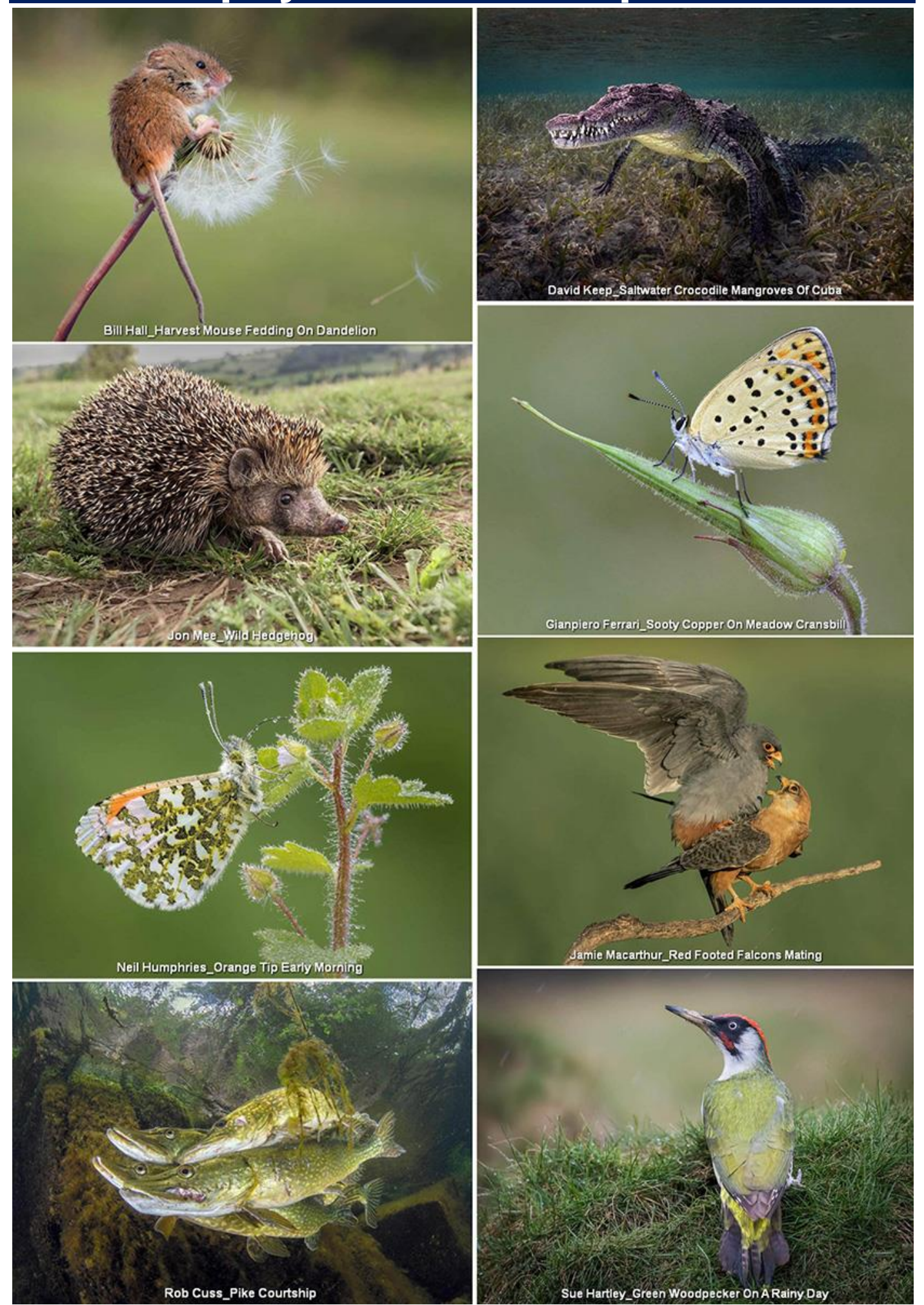
Page 8 of 12, e-news 252. 1 April 2020