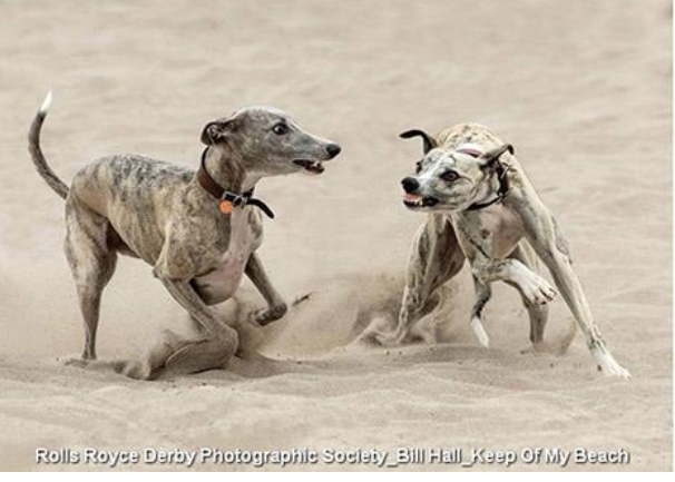
Page 4 of 12, e-news 252. 1 April 2020