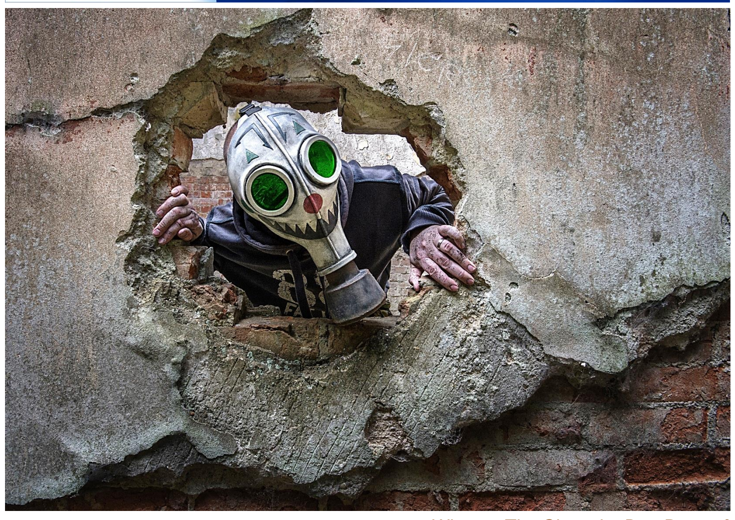
Wheezy The Clown by Dan Beecroft