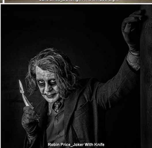
This is a selection from the winning entry and, if you click on any picture, you will be taken to our website where you can see all 24 prints entered by Chorley P.S.