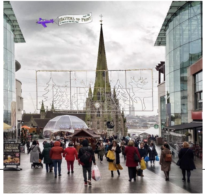
Crowds hurrying through the Bull Ring in the direction of the MASTERS OF PRINT . >>