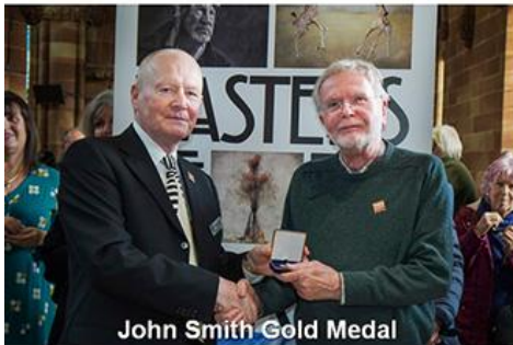
John Smith Gold Medal