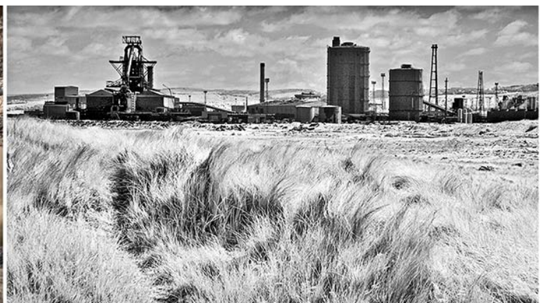
Wind of Change