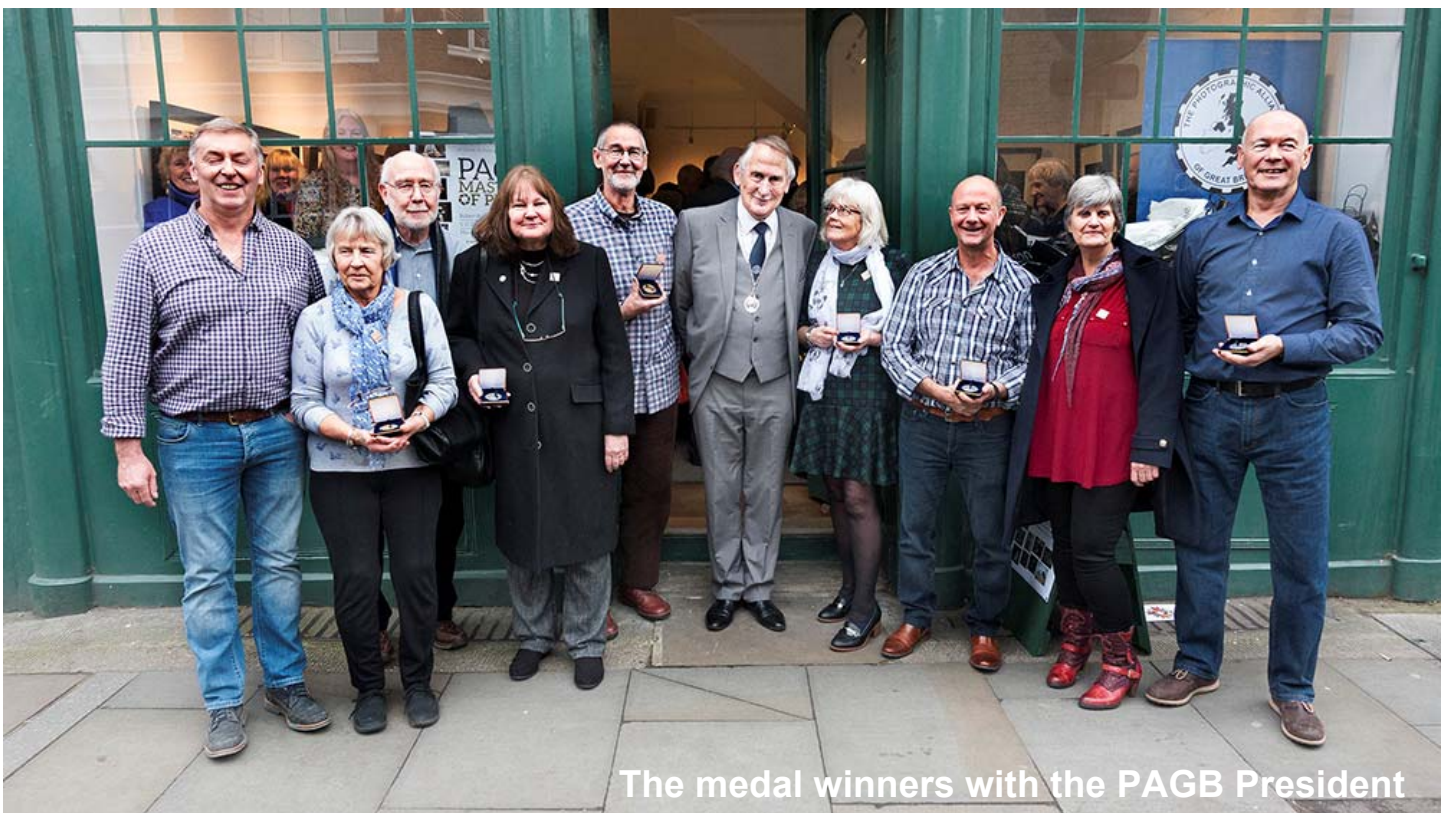
The medal winners with the PAGB President

We will publish many more of the pictures and stories from the first masters of print exhibition in later issues. We hope to tour the exhibition to several venues around the UK in 2018. Watch e-news for further information.