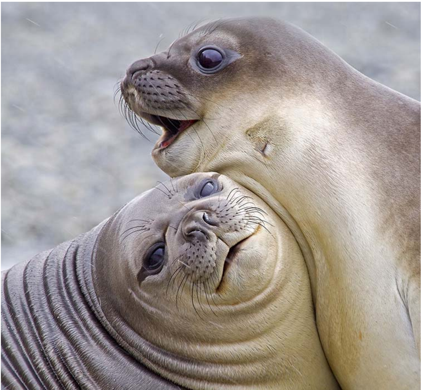
Elephant Seal Pups, Playfighting