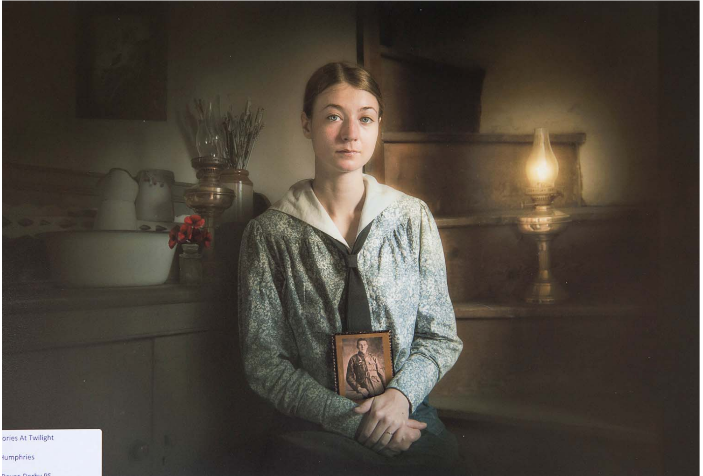
ories At Twilight Humphries Derby PS