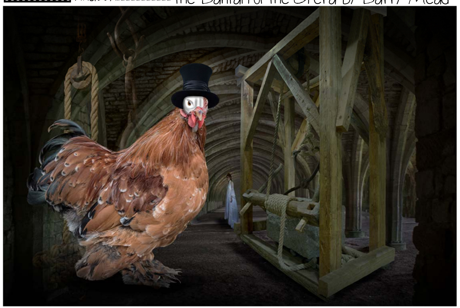
Page 11 of 11, e-news 194. 05 November 2017