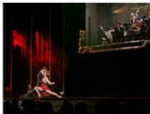
Tango Theatre by Malcolm Blackburn