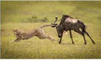
Cheetah with Wildebeest by Rita Daubeney