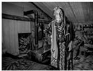
Simply Home by Sally Hammond