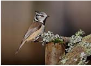
Crested Tit