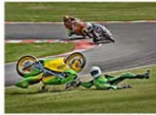
On the final lap