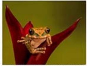
Peacock Tree Frog