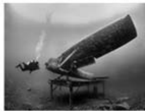
Diver and Cessna