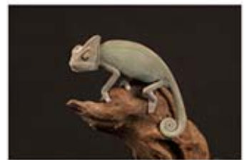
Yemen Chameleon