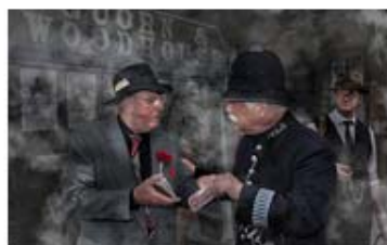
The Witness by Alan Young