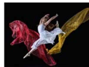
In Flight by Derwood Pamphilon