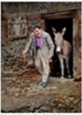
Off to Work by Sally Hammond