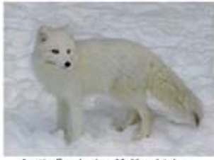
Arctic Fox