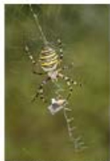
Argiope bruennichi and Prey