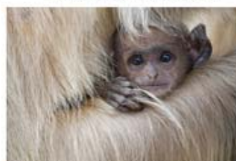
Baby Langur Monkey