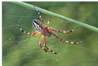
Aculepeira armida, Male