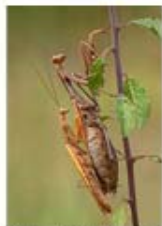
Mating European Praying Mantids