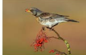
Fieldfare