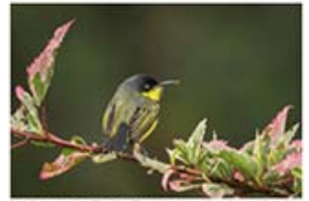
Common Tody Flycatcher