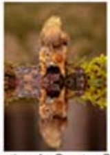
Red Reflections by Royston Packer