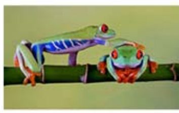
Red Eyed Tree Frogs by Sandra Cook