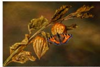
The Midas Touch - Aglais urticae by Ross Laney

CLICK ON any picture to view them all at a larger size on our e-news website