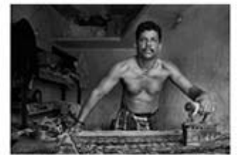
The Village Presser by Mark Bonelle