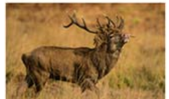
Pheromone Testing by Barrie Glover