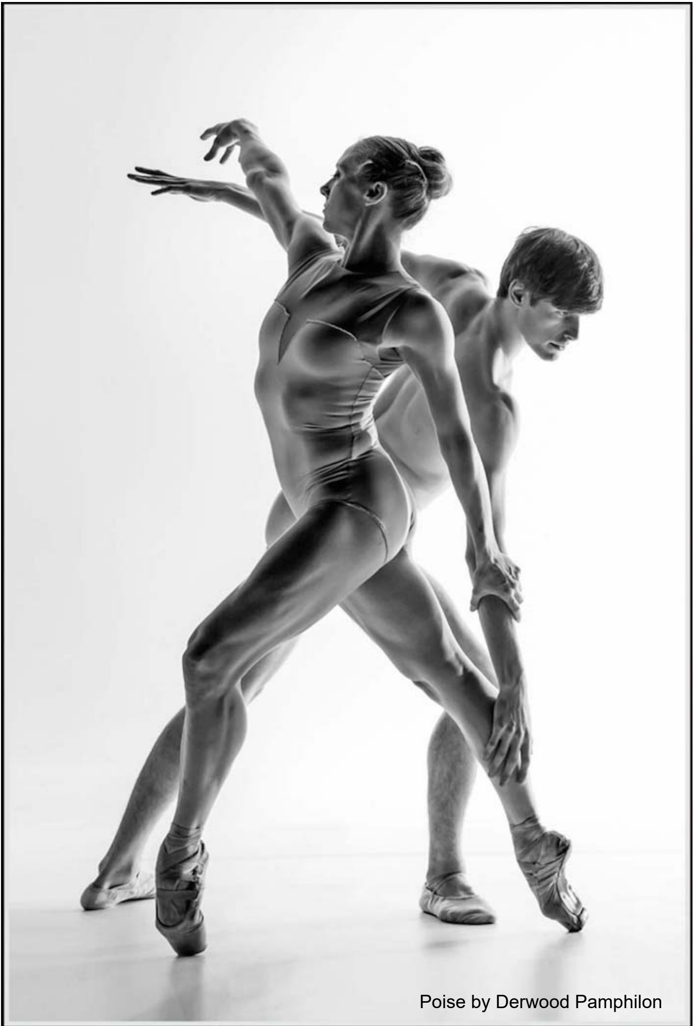
Poise by Derwood Pamphilon