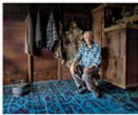
The Blue Room by Sally Hammond