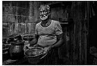
Kitchen Worker