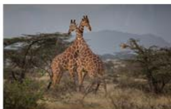
Reticulated Giraffes