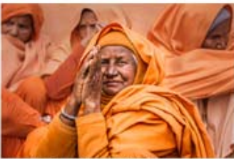
The Blessing by Peter Brisley.jpg