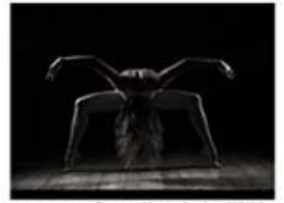
Contemporary Dance Nude by Ian Webb