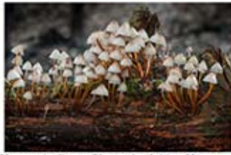
Mycena Inclinata Cluster