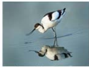
Avocet