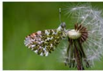
Male Orange Tip on Dandelion