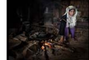
Woman of Hochtyn by Ian Webb