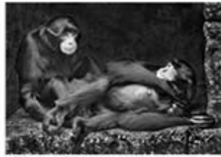
Siemang Gibbons