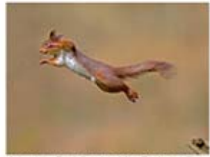
Leaping Red Squirrel