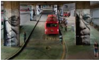
Watching Eyes by Sheila Tester.jpg