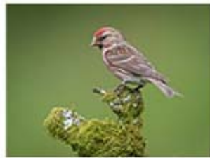
Redpoll