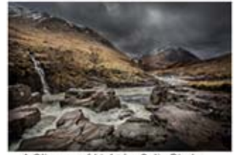
A Glimmer of Light by Colin Birch.