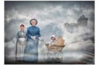
Nursemaids by Sue Sibley