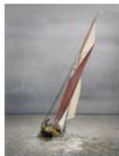
Last Boat Home by Colin Birch