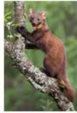
Adult Pine Marten