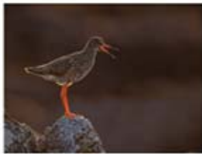
Redshank calling by Conor Molloy