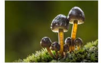
Mycena Nargan