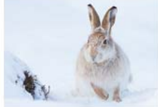
Mountain Hare running by Iain Friend.jpg