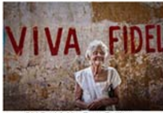
Old Faithful