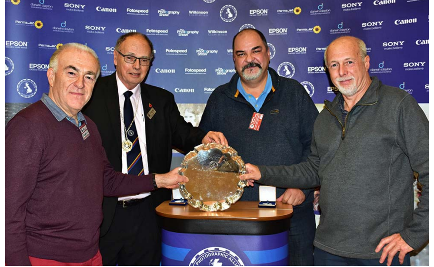
PLATE WINNERS 2016

The Clubs who don't quite make the Final in the Print Championship battle for the Terry Chapman Plate. Some famous club names have featured over the years.