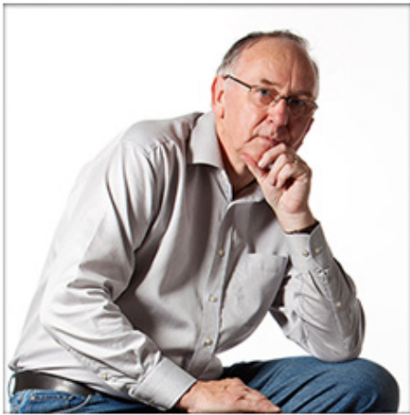
Les Profile image