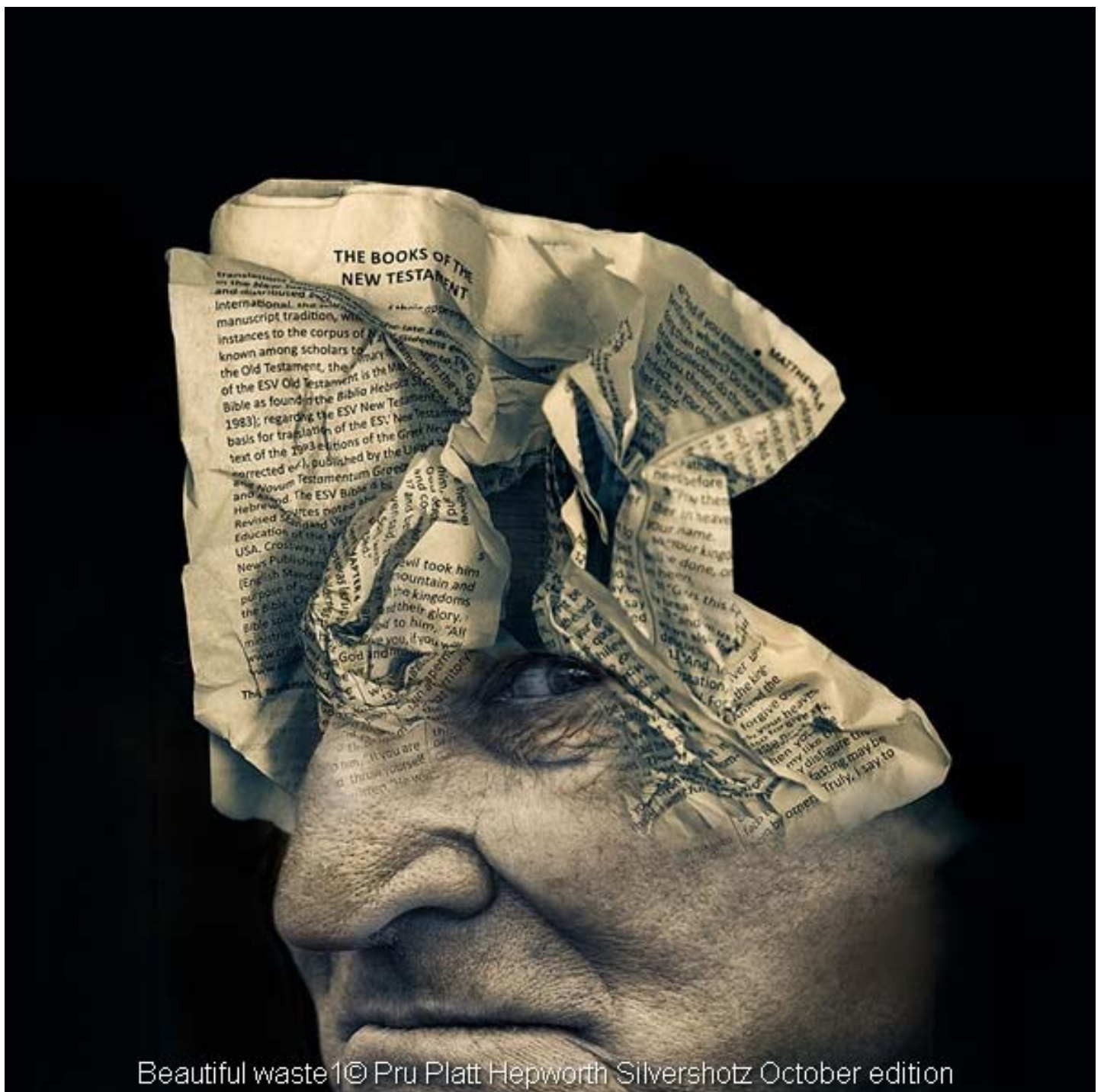
Beautiful waste 1 © Pru Platt Hepworth Silvershotz October edition

http://www.andybeelfrps.co.uk/product/yorkshire-monochrome-masterclass/