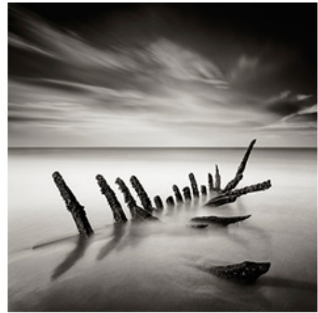
Time Waits for No Man