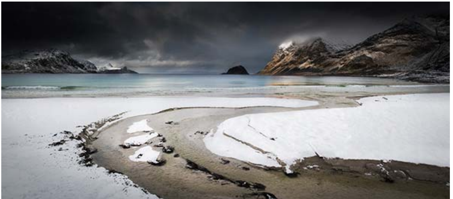
David Byrne, Arctic Winter Beach