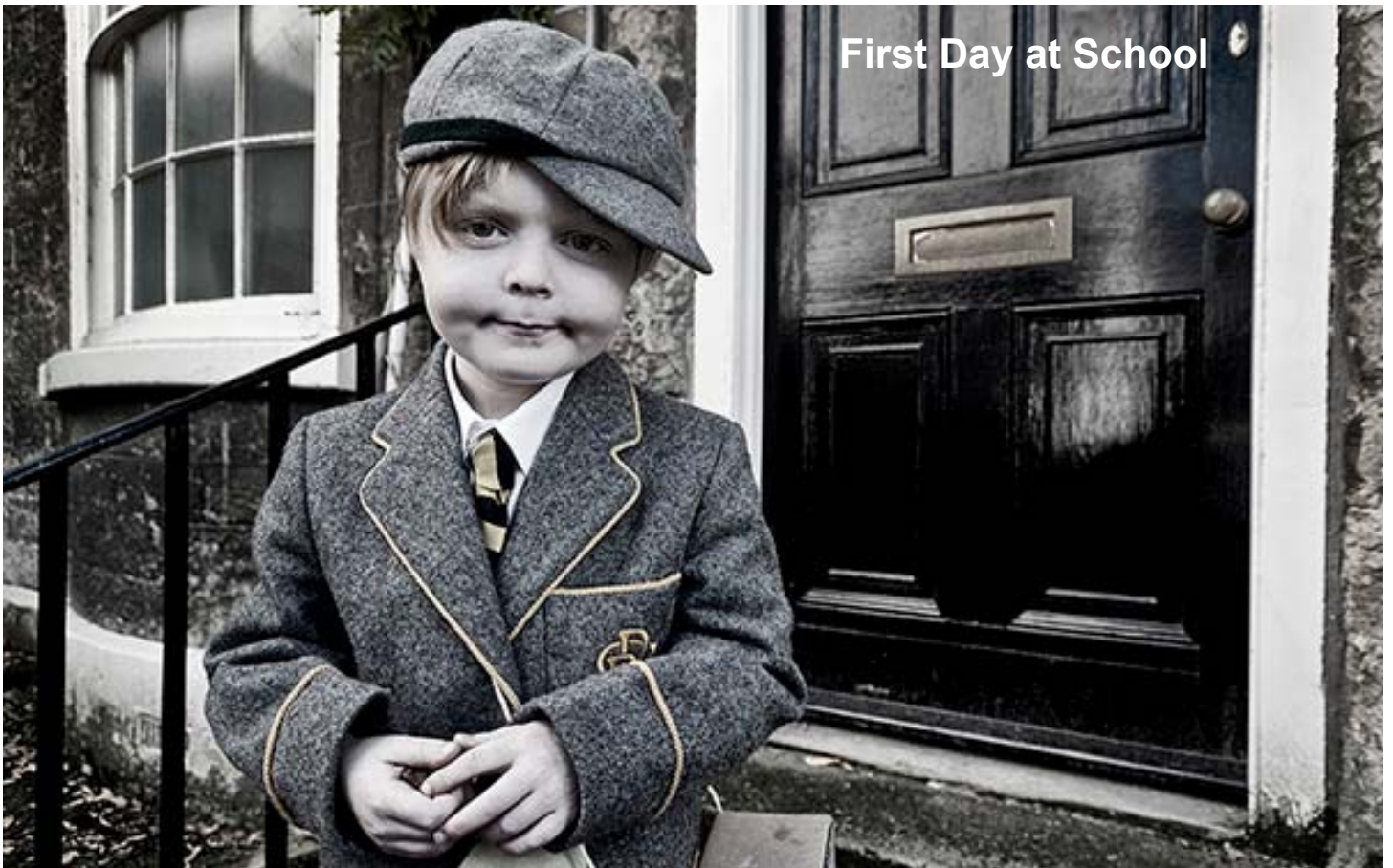
First Day at School

"On the day, before they started the adjudication the Master applicants were told to "prepare ourselves" as the pass rate was low, apparently about 1 in 5. Gulp!"