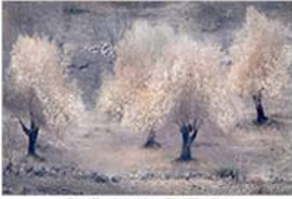
Roy Essery_After The Fire.jpg