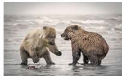
15_MP272_Protecting his Fish.jpg