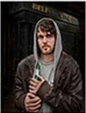
03_MP272_My Precious .jpg