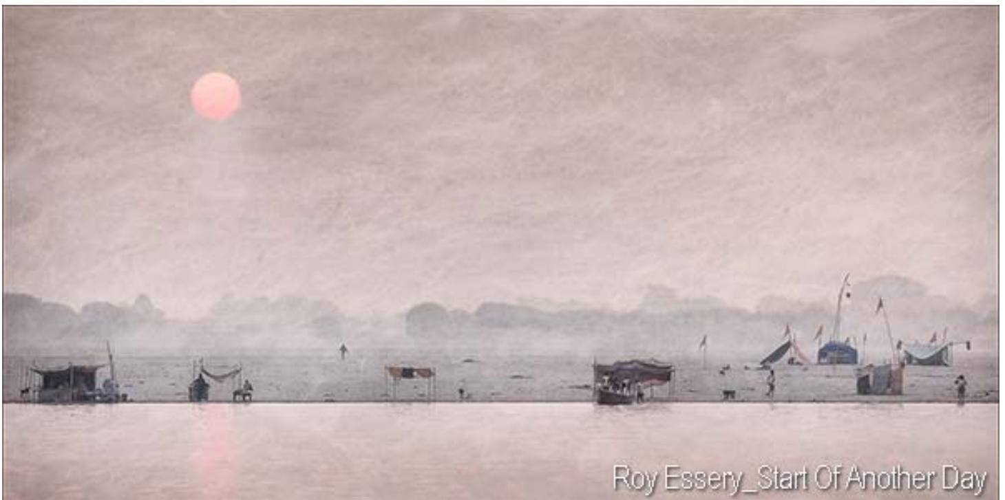
Roy Essery_Start Of Another Day

My photographic interest and style lies very much in the making of images having a strong pictorial bias, whether wholly created “in camera” or subsequently during the post capture digital process. See more at http://www.shuttershot.co.uk/