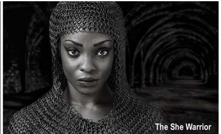
The She Warrior