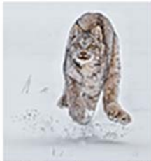
14_MP272_Young Lynx in mid air.jpg