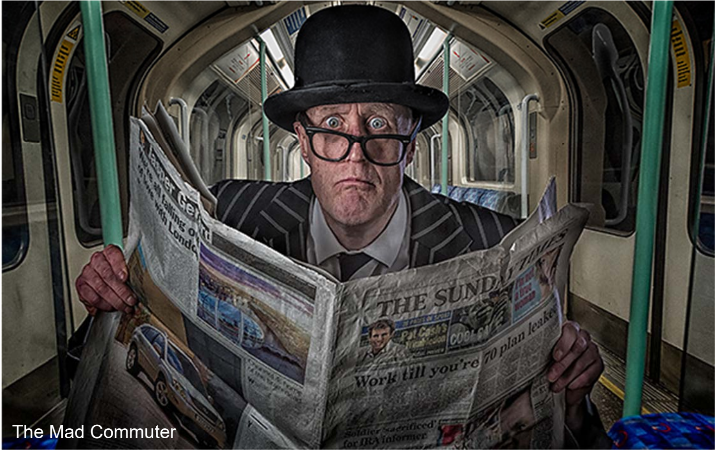
The Mad Commuter