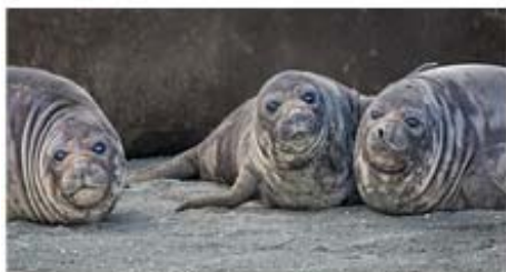
08_MP272_The Three Amigos.jpg