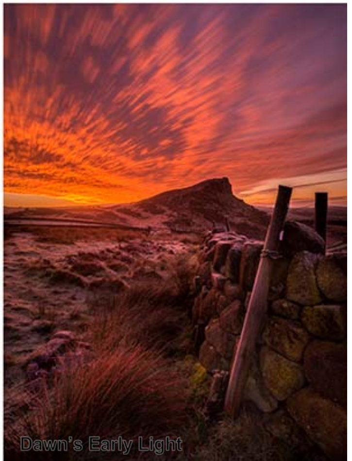
Dawn's Early Light

"On my favourite T-shirt: always be yourself, unless you can be Batman. Then Always Be Batman!"