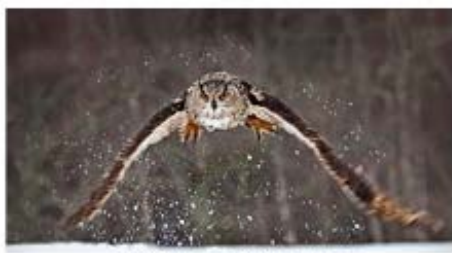
04_MP272_Eagle Owl Hunting.jpg