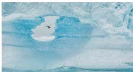
11_MP272_Tern through the Iceberg.jpg