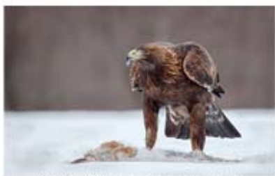
01_MP272_Golden Eagle and Hare .jpg