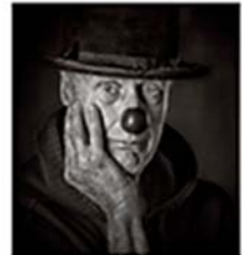
06_MP272_Mr Whizzy Off Duty.jpg