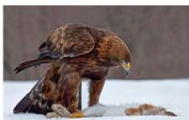
17_MP272_Golden Eagle with Kill.jpg