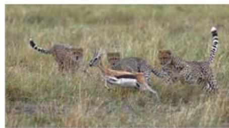
07_MP272_Three against One.jpg