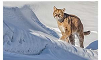
05_MP272_Puma Stalking its Prey.jpg