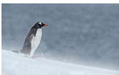
16_MP272_Gentoo in Snow storm.jpg