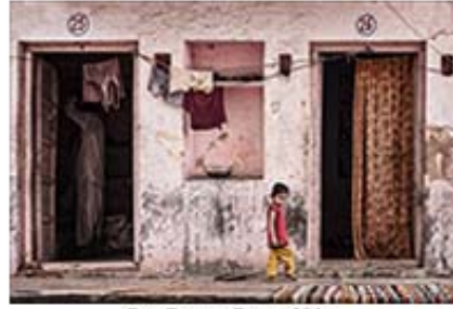
Roy Essery_Boy at 26.jpg