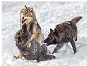
02_MP272_Alpha Male Exerting his Authority.jpg