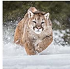
18_MP272_Puma in Deep Snow.jpg