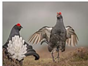
13_MP272_Black Grouse Confrontation.jpg