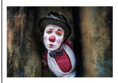
05 Clowning - Mike Sharples