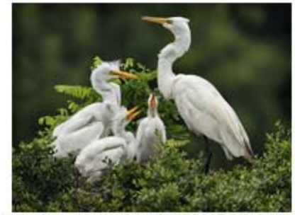
Egret Family