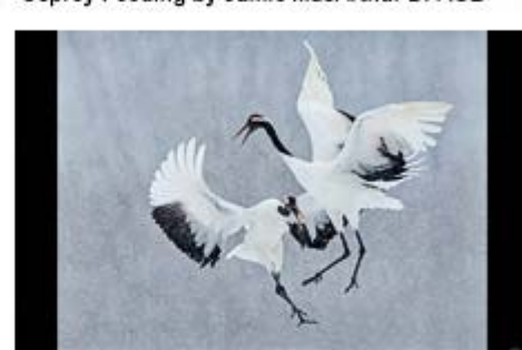
Red Crowned Cranes in Snow