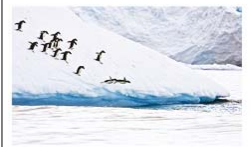
Penguin Plunge by Keith Snell LRPS AFIAP