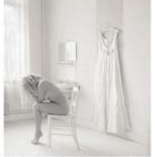
06 Despair - Dinah Jayes