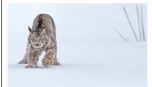
Young Lynx in Snow