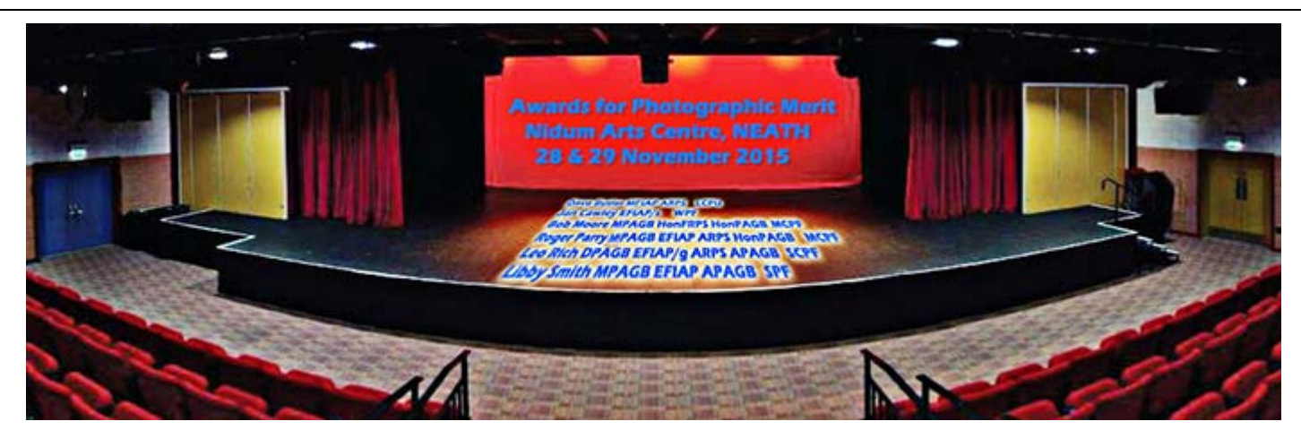
The Awards for Photographic Merit in November 2015 have now been booked at the Nidum Arts Centre in Neath http://www.nptc-cvp.com/nidum_arts_centre/

Sample taken from the successful entrants in 2012 for whom we hold PDIs and PDI copies of Prints 39 x CPAGB = 390, 21 x DPAGB = 315. 4 x MPAGB = 80. A total of 785 with slightly more Prints than PDI.