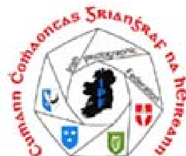
Comhghairdeas ar thrí dámhachtainí Éireannacha