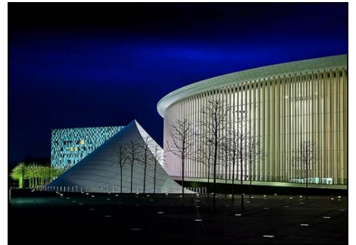
HM Philharmonie Luxembourg