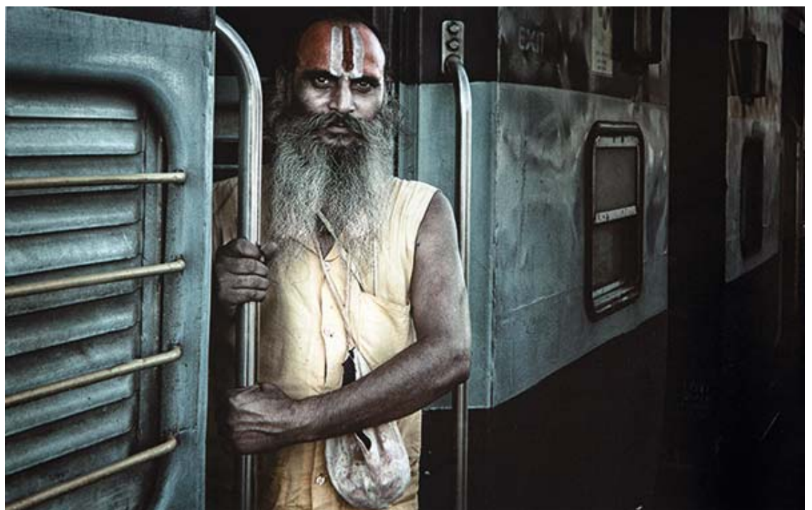
The Traveller >> by Muhannad Al Badawi Oman