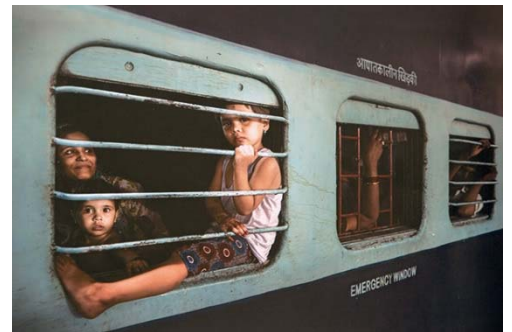
HM Train by Hamed Al Ghanboosi Oman