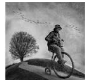
WIG37_Lynne Morris_Tour de France pg