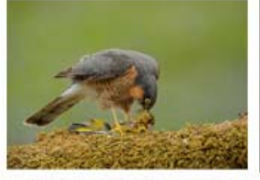
INN36_Phil Morgan_Top of the Food Chain ipg

INN17_Genwyn Wilkems_Hunter or Protector.jpg