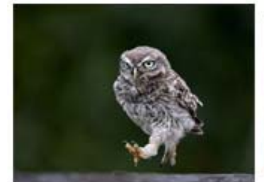
WIG21_Austin Thomas_Juvenile Little Owl running.jpg WIG23_KT Allen_Lady Hope of Deepdale moor.jpg