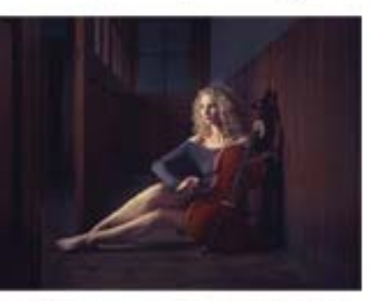
INN14_Coltrane Koh_The Tantaising Tune.jpg