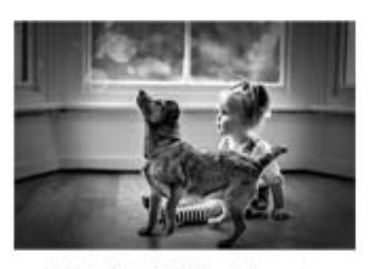
WIG39_Cheryl Wild_Waiting for the pop.jpg