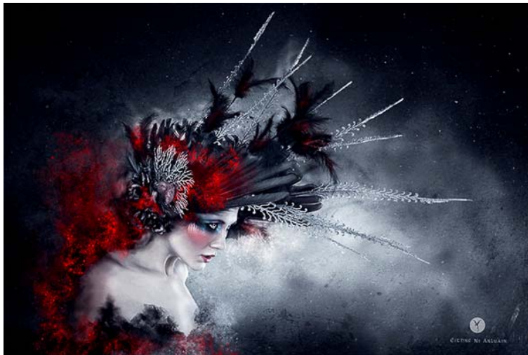
Three by Eithné.

Remember, you can click on the pictures to browse them on the e-news website.