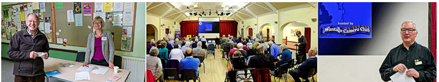
Some pictures of the day