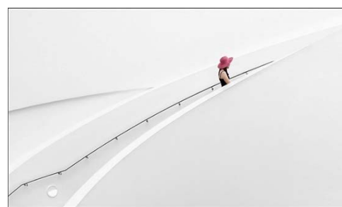
The Pink Hat by Pam Sherren, Paignton PC, WCPF

CLICK HERE for e-news 142 Extra with all the top Individual Awards from the 2015 Inter-Federation Annual Competitions