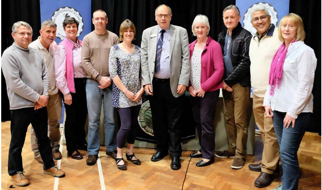
Successful CPAGB and DPAGB entrants pictured with the PAGB President at Southampton in April