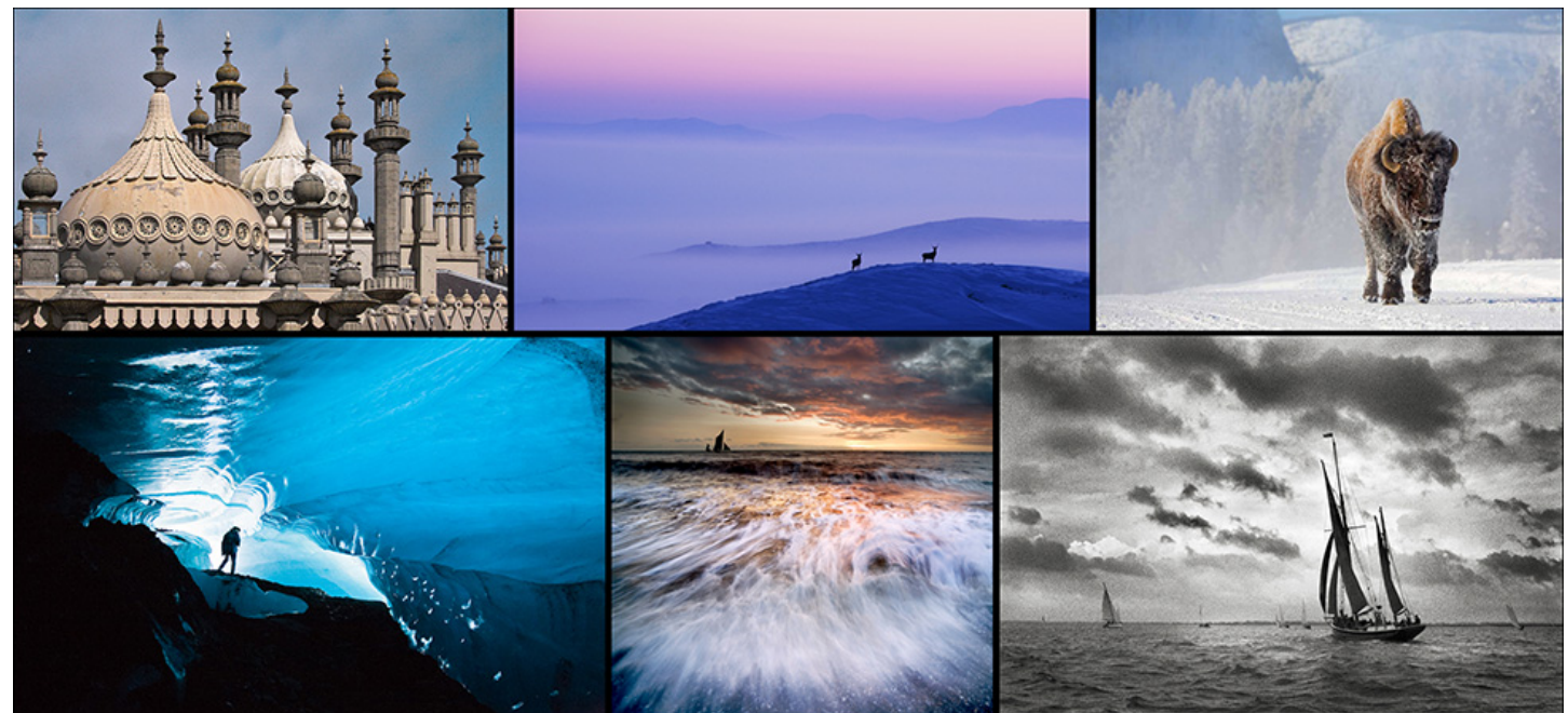
'Brighton Pavilion' by Adrian Bowd 'Inside the Glacier' by Monty Trent

1931 you write a brief appraisal about each one - in effect, you are acting as the 'club judge'! In turn, your own picture receives comments from the other members of your Circle. There are also several 'on-line' Circles in UPP, which operate slightly differently, but which provide similar benefits, plus the advantage of having no postal charges.