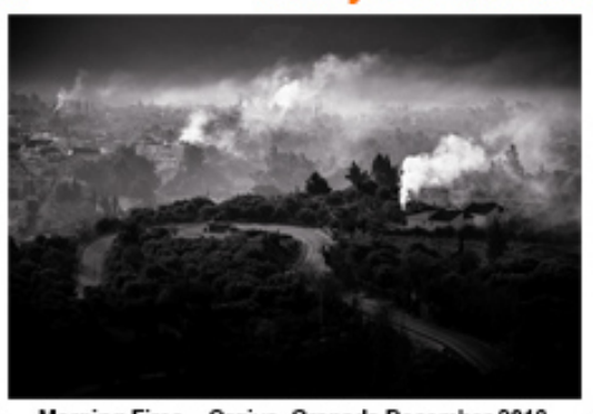
Morning Fires – Orgiva, Granada December 2013 Learn Grow and Flourish