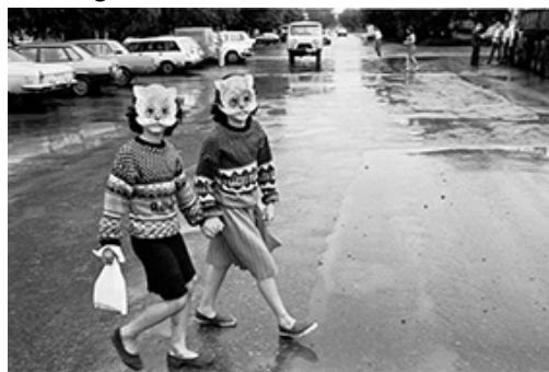
Sergey Kiselev (Russia), Masks .

Now in its 157 th year, The Royal Photographic Society's annual International Print Exhibition is the longest standing exhibition of its kind in the world, dating back to 1854. Over 6,600 images were entered by 1727 photographers from 72 countries and just 100 were selected for exhibition. Berkeley Gallery, Greenwich Heritage Centre, Woolwich, from 31 July to 28 August 2014. http://www.royalgreenwich.gov.uk/heritagecentre/info/2/what_s_on