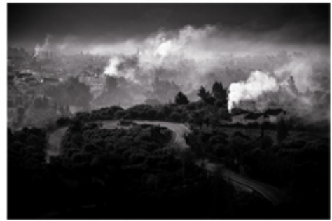
Morning Fires – Orgiva, Granada December 2013