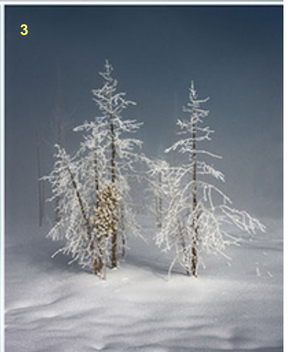
1. The Lone Tree 2. Trees in Mist 3. Frosted