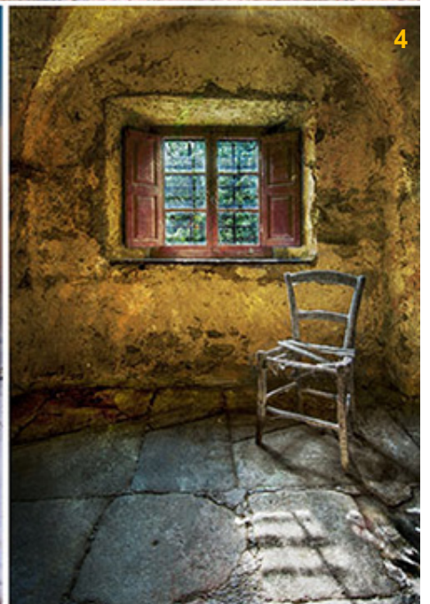
1 First Light, Sierra Nevada 2 First Light on the Storr 3 Castle in the Mist 4 Window Seat