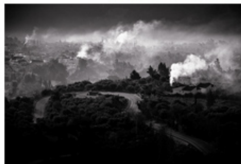
Morning Fires – Orgiva, Granada December 2013