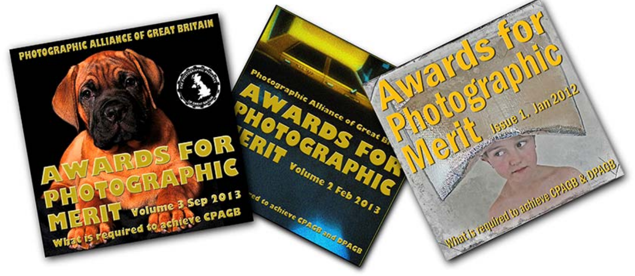
Available now from the PAGB Recorded Lecture Service

Want to know more about the Awards for Photographic Merit?