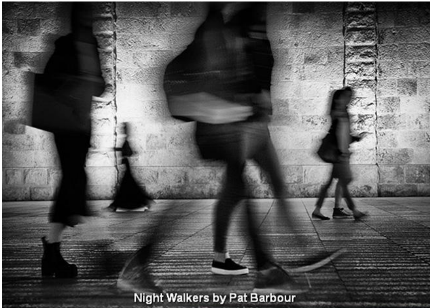
Night Walkers by Pat Barbour