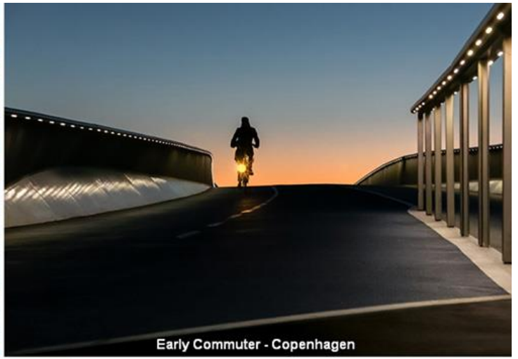
Early Commuter - Copenhagen