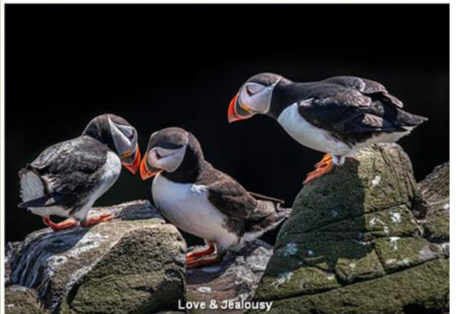
Love & Jealousy