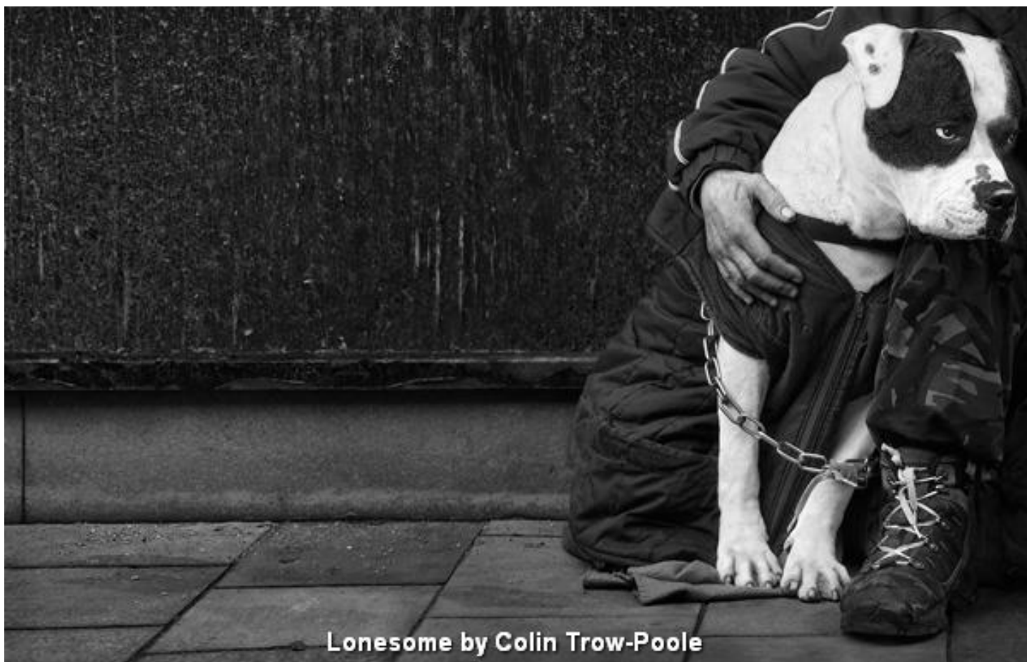
Lonesome

Of all the pictures published in e-news, since the first issue in August 2008, this is my favourite. It was a very difficult choice and you can see a personal selection of many more unforgettable photos at http://www.pagbnews.co.uk/sites/default/files/newsletters/en236%20extra%20Once%20Seen.pdf .