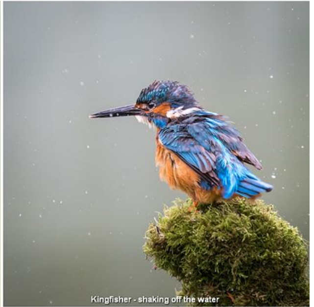
Kingfisher - shaking off the water