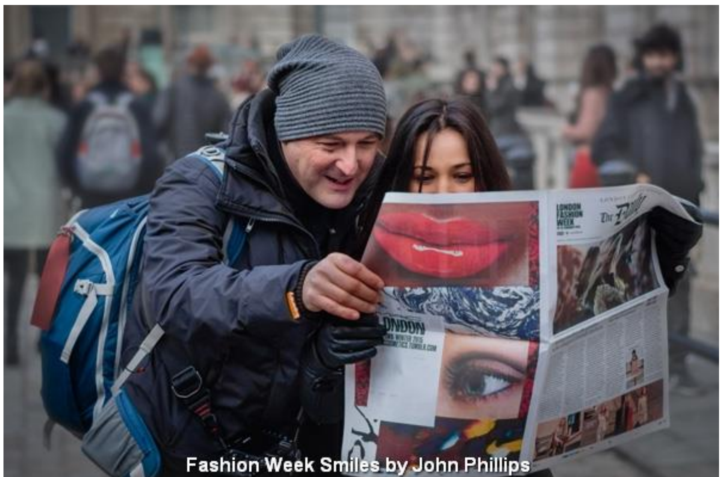
Fashion Week Smiles