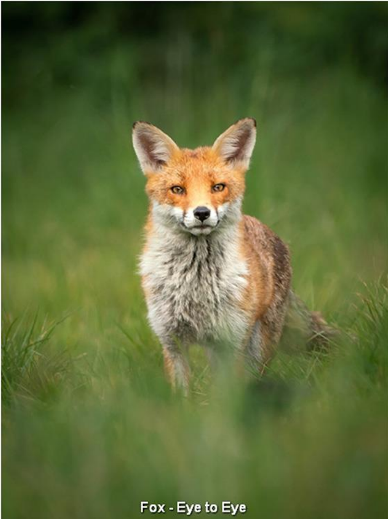
Fox - Eye to Eye