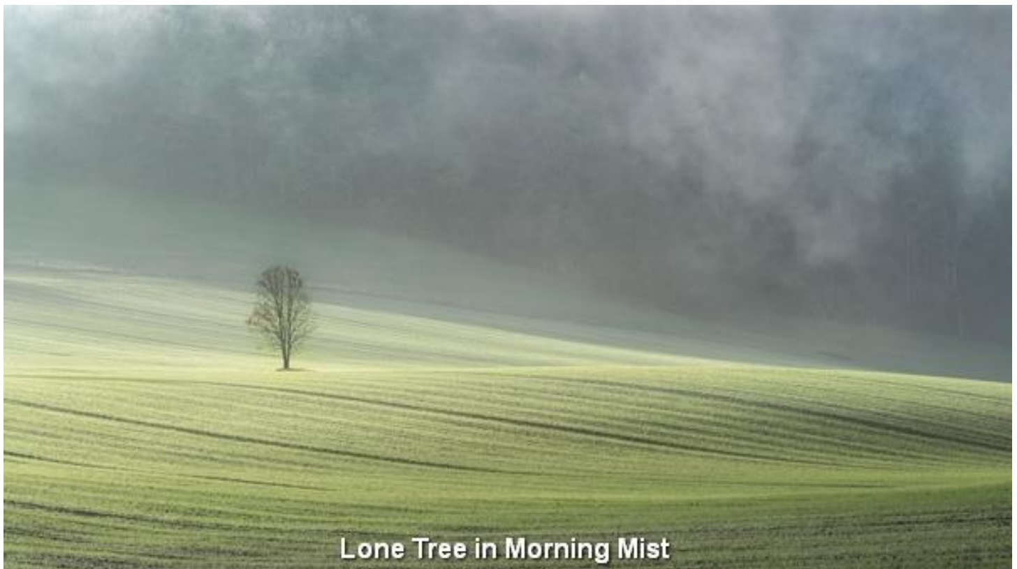
Lone Tree in Morning Mist

I was surprised to find that photography has been a fantastic way of meeting people. When shooting landscapes, I invariably end up in conversations with passing ramblers who are often fascinated to know more about my composition or methods. Photography led me to become a member of the first 'club' I have ever joined, Tring & District Camera Club and this eventually led to the honour of election as Chair of this fantastic club, where we focus on 'having fun, learning about photography'. I also became a regional judge in 2018 and this provides a way of meeting people and seeing a wide range of great photography.