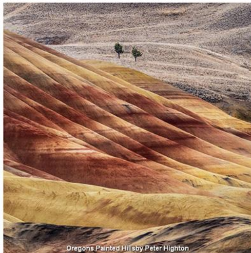
Oregons Painted Hills