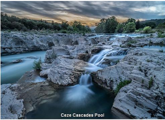
Ceze Cascades Pool