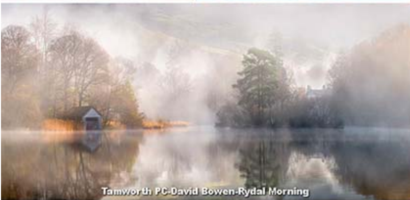
Tamworth PC-David Bowen-Rydal Morning