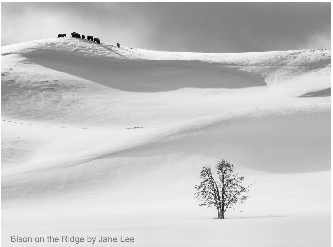
Bison on the Ridge by Jane Lee

I love being outdoors, photographing landscapes, especially seascapes, mountains and snow scenes but I also enjoy sport and wildlife when the opportunities arise. I am never happier than when I am standing on a beach desperately hanging onto my tripod while the waves lap around my wellies or fighting cold fingers and toes in some frozen landscape!