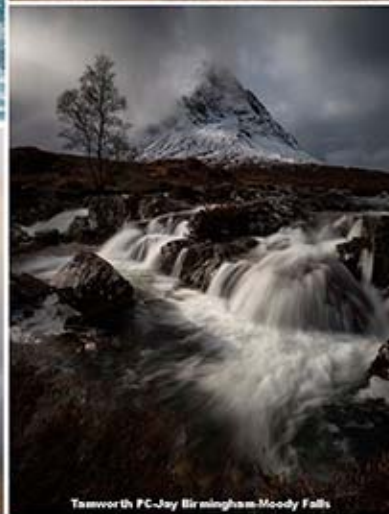
Tamworth PC-Jay Birmingham-Moody Falls