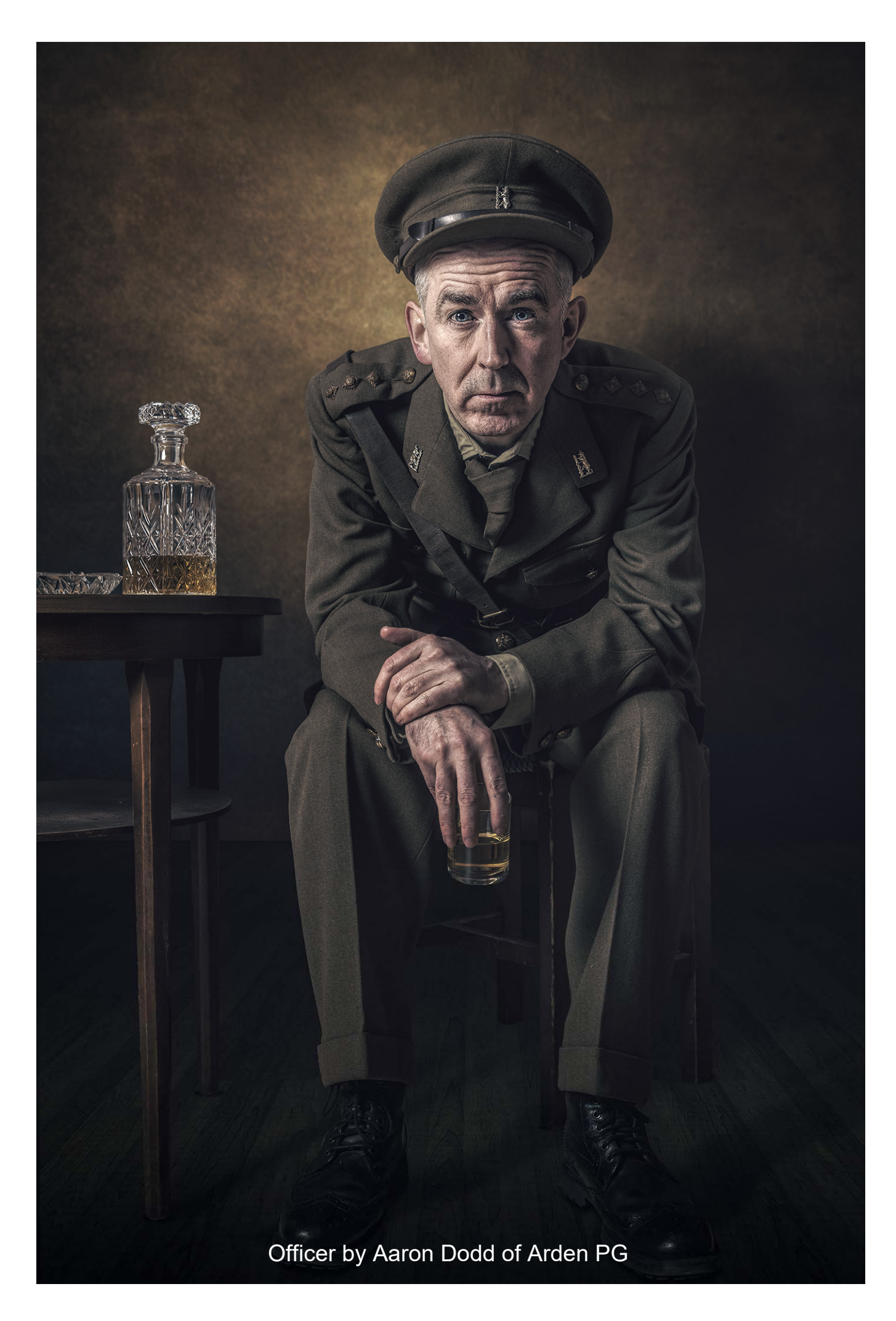
Page 5 of 11, e-news 219 extra. Dec 2018