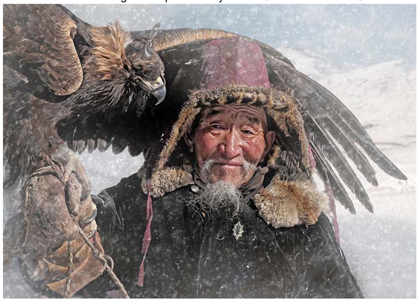
The Oldest Eagle Hunter by Jane Lines of Chorley PS