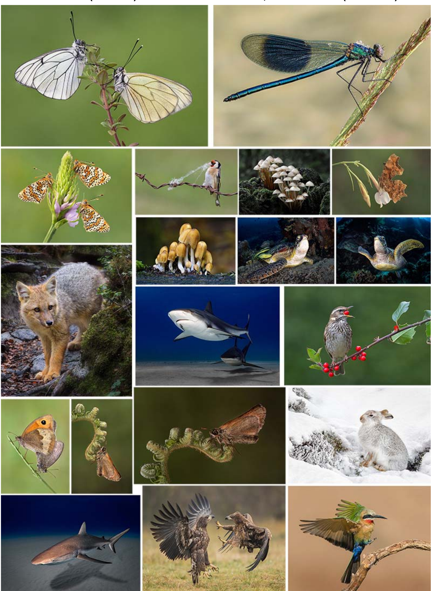
Although only twelve pictures count in the Result, we have included all those that scored 15, 14 plus all the 13s, which could all have contributed to the winning total. CLICK ON the pictures to see them larger on our website.