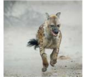
WRE12_ Audrey Price_ hyena running