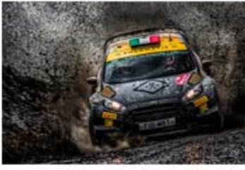
WIG1_Damian Digging In