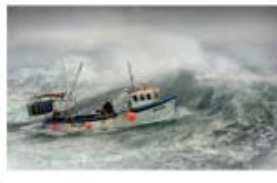
ROL27_Tony Ng_Perfect Storm