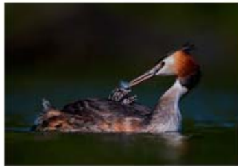
WIG8_Austin Thomas_Great Crested Grebe with two chicks