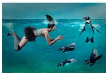
WIG25_Lynne Morris_Short Shark Shock