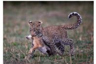
WIG17_Austin Thomas_Leopard cub dragging hare