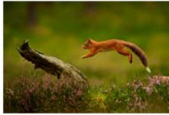
Jumping red squirrel