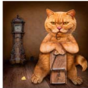
WIG15_Lynne Morris_Mouse Trap