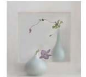
ROL17_Katrina Mee_Delicate Form.jpg