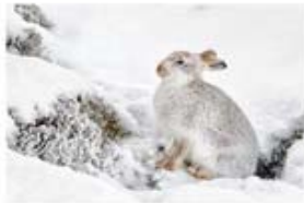
ROL7_Gianpiero Ferrari_Surviving in Deep Sn...