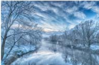
WRE15_ Norman O Neill_ view down the severn