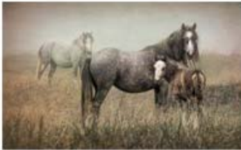
WRE4_ Calvin Downes_ keeping an eye