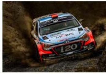
WIG10_Damian Turn and Burn