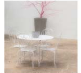
WRE29_ Irene Froy_ the pink tree