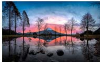
WRE16_ Calvin Downes_ sunrise behind mount fuji