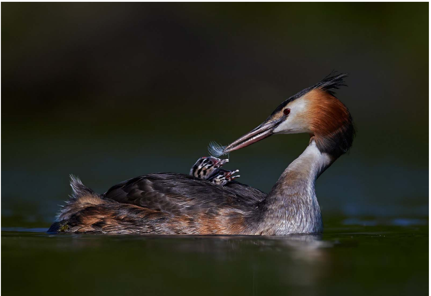
Austin Thomas - Great Crested Grebe with Two Chicks