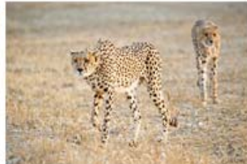
WRE17_ Russell Price_ cheetah coalition