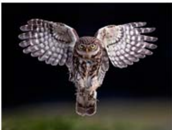
WIG23_Austin Thomas_Little Owl landing