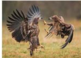
ROL33_Jamie MacArthur_Squabbling Juvenile W...