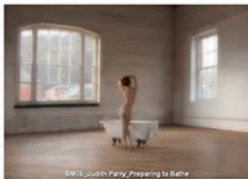
SME5_Judith Parry_Preparing to Bathe