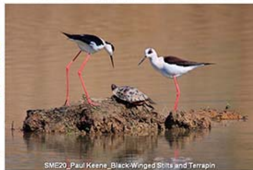
SME20_Paul Keene_Black-Winged Stilts and Terrapin