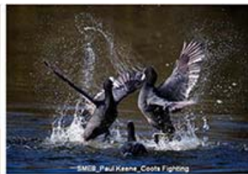
SME8_Paul Keene_Coots Fighting