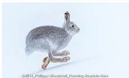
SME14_Philippa Wheatcroft_Stunning Abscertain Hate