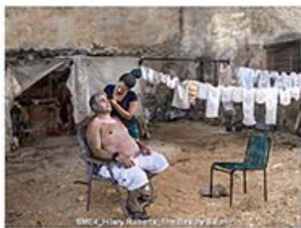
SME4_Hilary Roberts_Fire in the Sky