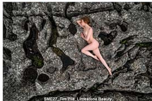
SME27_Tim Pile_Limestone Beauty