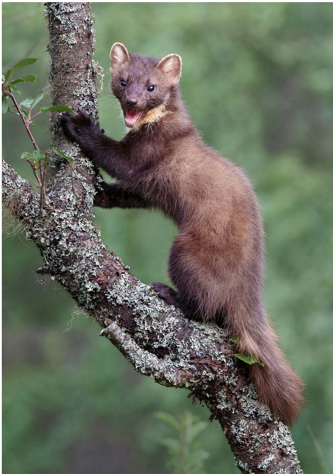
"Wild Male Pine Marten"