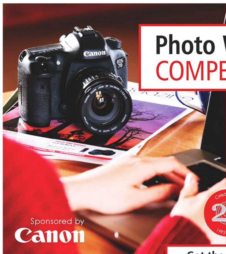
Photo Writing COMPETITION

HOLD YOUR PLACE WITH A £200 DEPOSIT AT HTTPS://NATURESLENS.CO.UK/EVENT/DALMATIAN-PELICANS-OF-LAKE-KERKINI-2019/