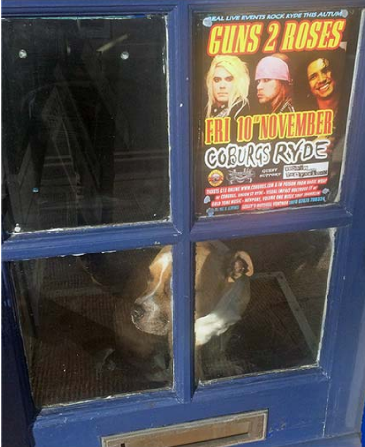
“Pssst - you wanna ticket?”

Rather like the 'Life After Coffee' exhibition featured in e-news last year, this one started by chance. I started noticing a couple of opportunities to capture an image of a dog in a situation and giving the resultant picture a title that reflects what I think the dog may be thinking. I tested the waters at a couple of Clubs, including a Members' Evening at the Hampstead Photographic Society just to make sure that I was not barking up the wrong tree! (sorry - I couldn't resist that one). The comedy of such a scenario was not lost on the audiences, with some members being very encouraging. For the first time in ages, I have decided NOT to do anything creative and let the subject do its own talking. All I have done is capture the image and given it a 'canine thought'.