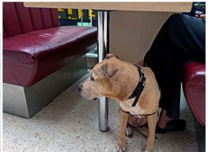
“Get off that phone - we'll miss the train.”