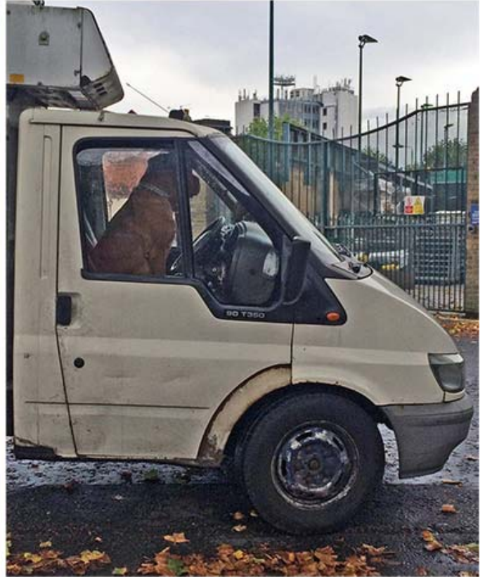
“Where did he hide the keys?”