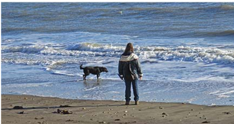
“It is OK – it's not too cold.”