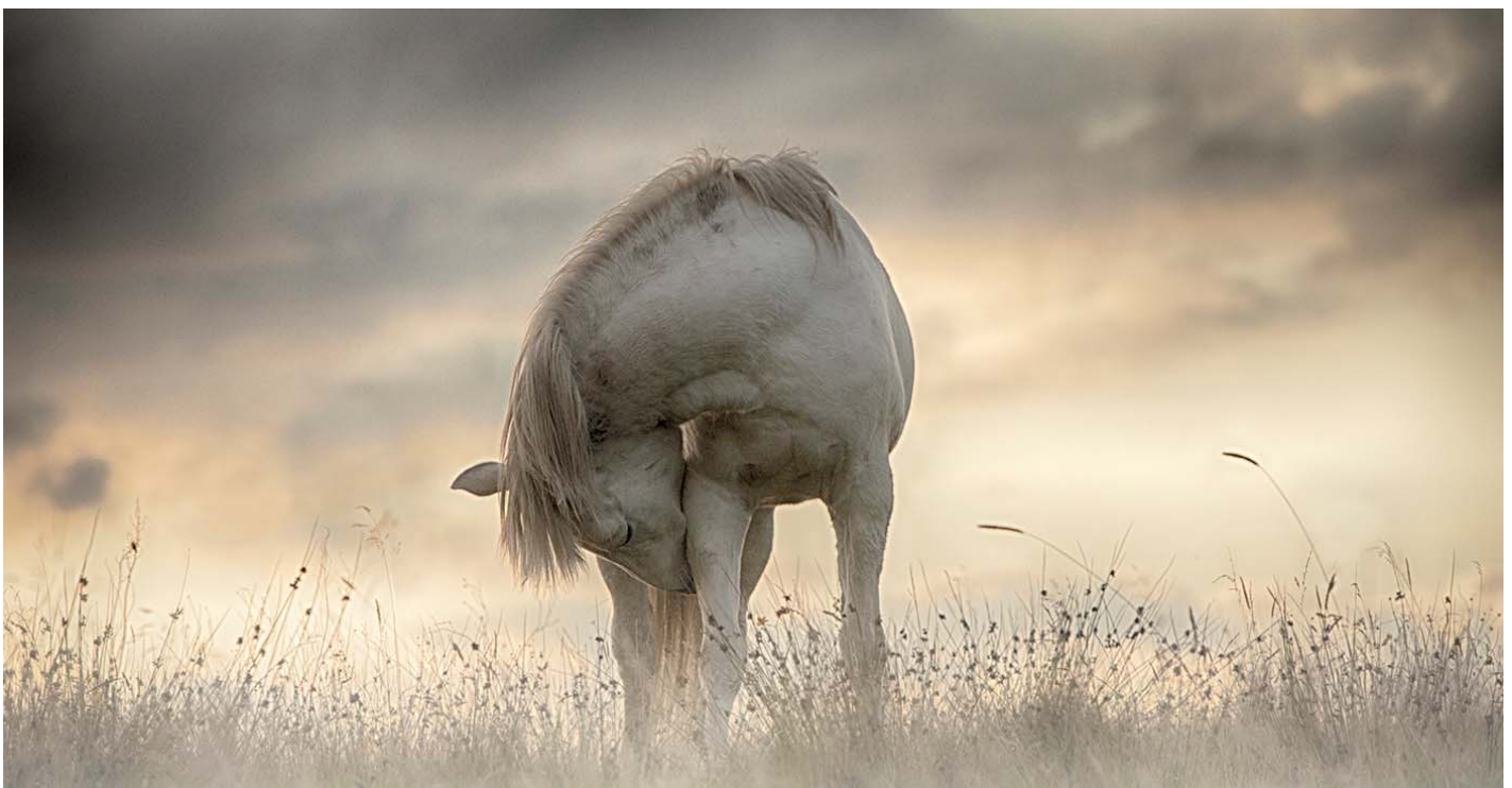
Golden Beauty was taken whilst returning home from an sRGB Print Exhibition. The sun was setting behind the pony as we pulled onto the grass verge. Three of us made a mad dash into the field to take a few shots before the light was lost. Thankfully, over the years, I have learnt not to delete images too soon, and with some post production, I still don't know how I got to the finished image. I am over the moon that it was exhibited in the masters of print in the RK Burt Gallery.