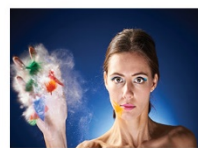
Unusual IR beam application