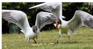
TriggerBeam in action

Contact us to obtain special 'Club Member' discounts or to discuss your latest project. Maybe we could offer your Club to give a presentation, which we promise will be very different to the normal 'circuit' talks subject to location.