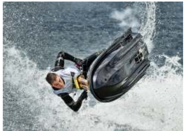
Tight Turn by Dave Bowen MPAGB

Very few people have the depth of good work needed to succeed at this level and few clubs have more than one MPAGB. It can only be a matter of time before Tamworth PC has another.